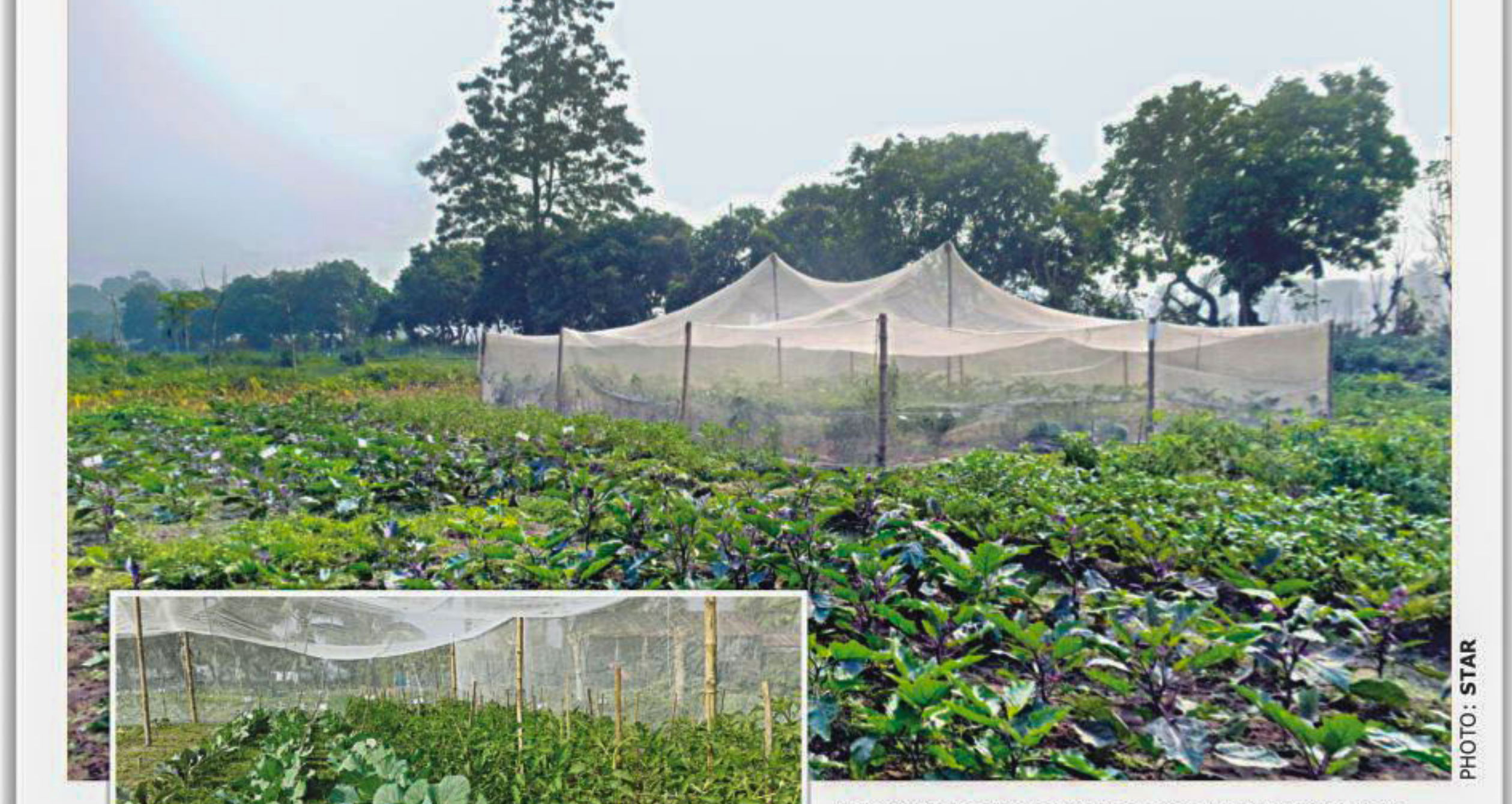
A vegetable patch with a pest exclusion net (PEN), an environment-friendly crop protection technology, on the campus of Bangladesh Agricultural University. Inset, a plot of healthy plants reaping benefits of the technology.

The research is being funded by USAID and development organisation Winrock International.