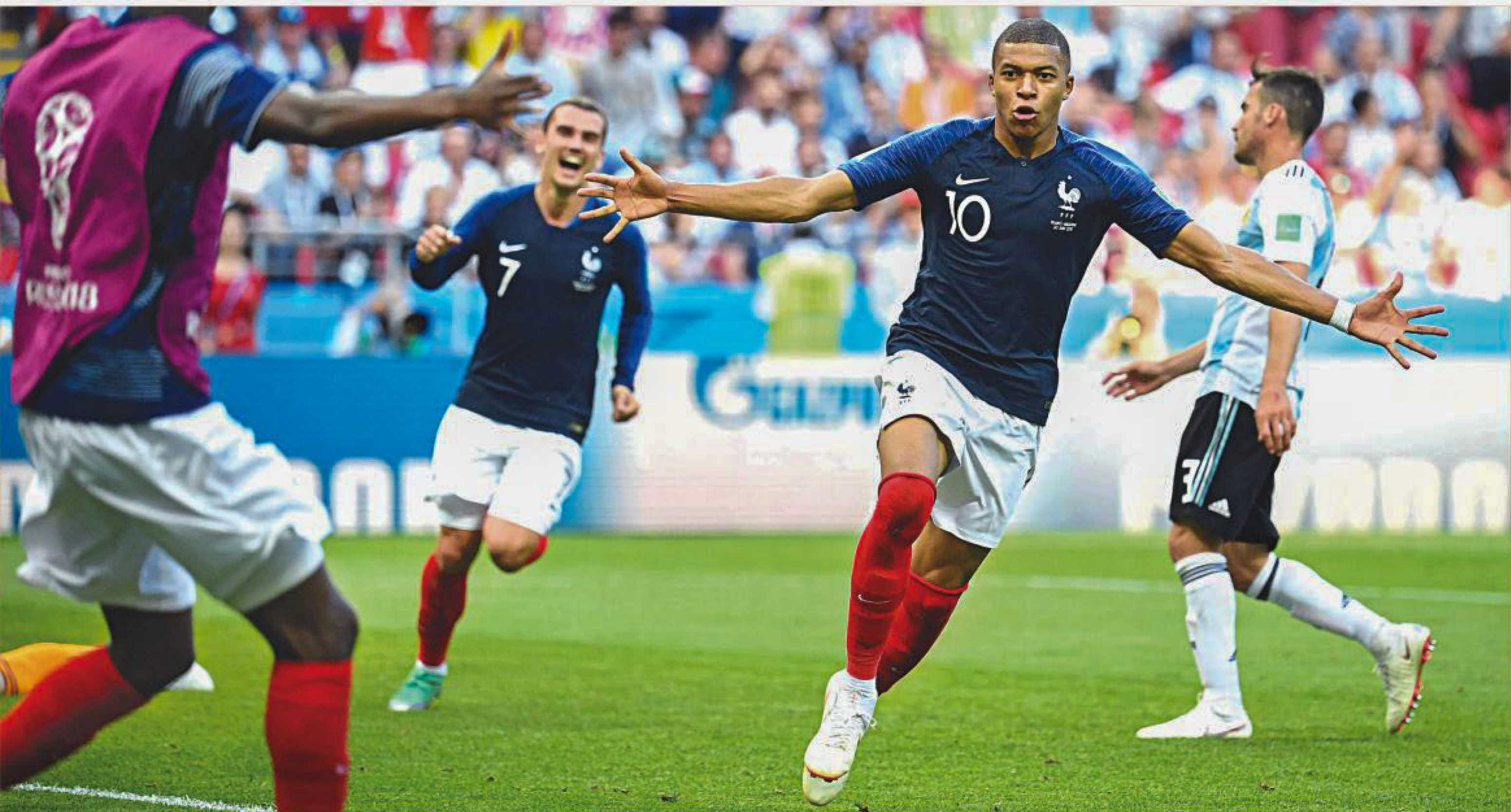
France forward Kylian Mbappe (C) ran roughshod over the Argentine backline, becoming the first teenager to score at least twice in a World Cup match since the great Pele against Sweden in 1958, as France emerged 4-3 winners in the round of 16 clash at the Kazan Arena yesterday.