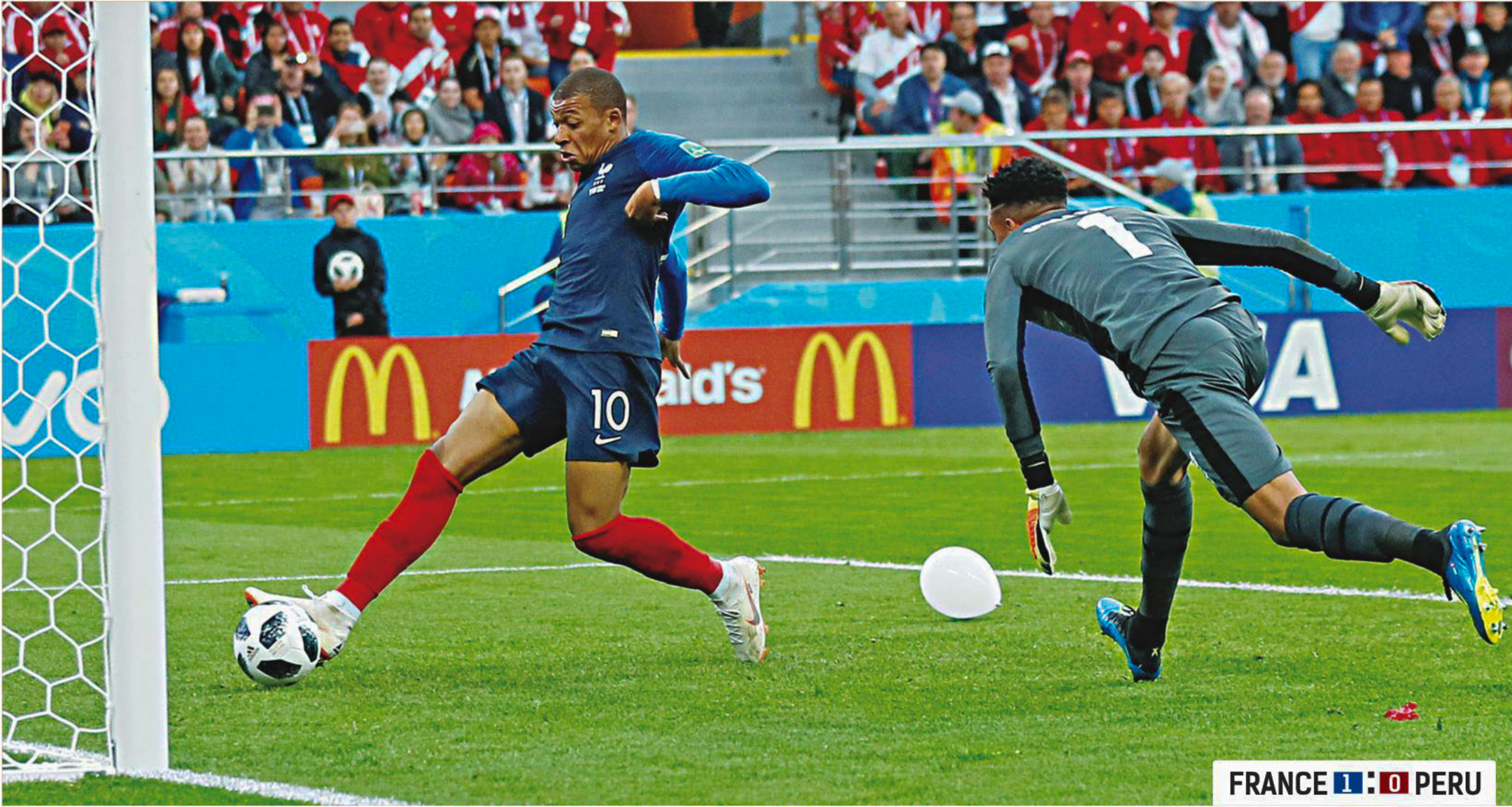
Kylian Mbappe (L) became the youngest French player to score in a World Cup, getting the decisive goal in a 1-0 win over Peru yesterday. The win means that France advance to the round of 16 while the winless Incas are eliminated.

MARCELO (BRAZIL) Always runs onto the pitch right foot first. The habit is so ingrained that during training in Rostov-on-Don he left the pitch and re-entered after realising he had accidentally led with his left foot. "Everybody likes to enter with the right foot, right? I'm no different," he laughed when quizzed by reporters.