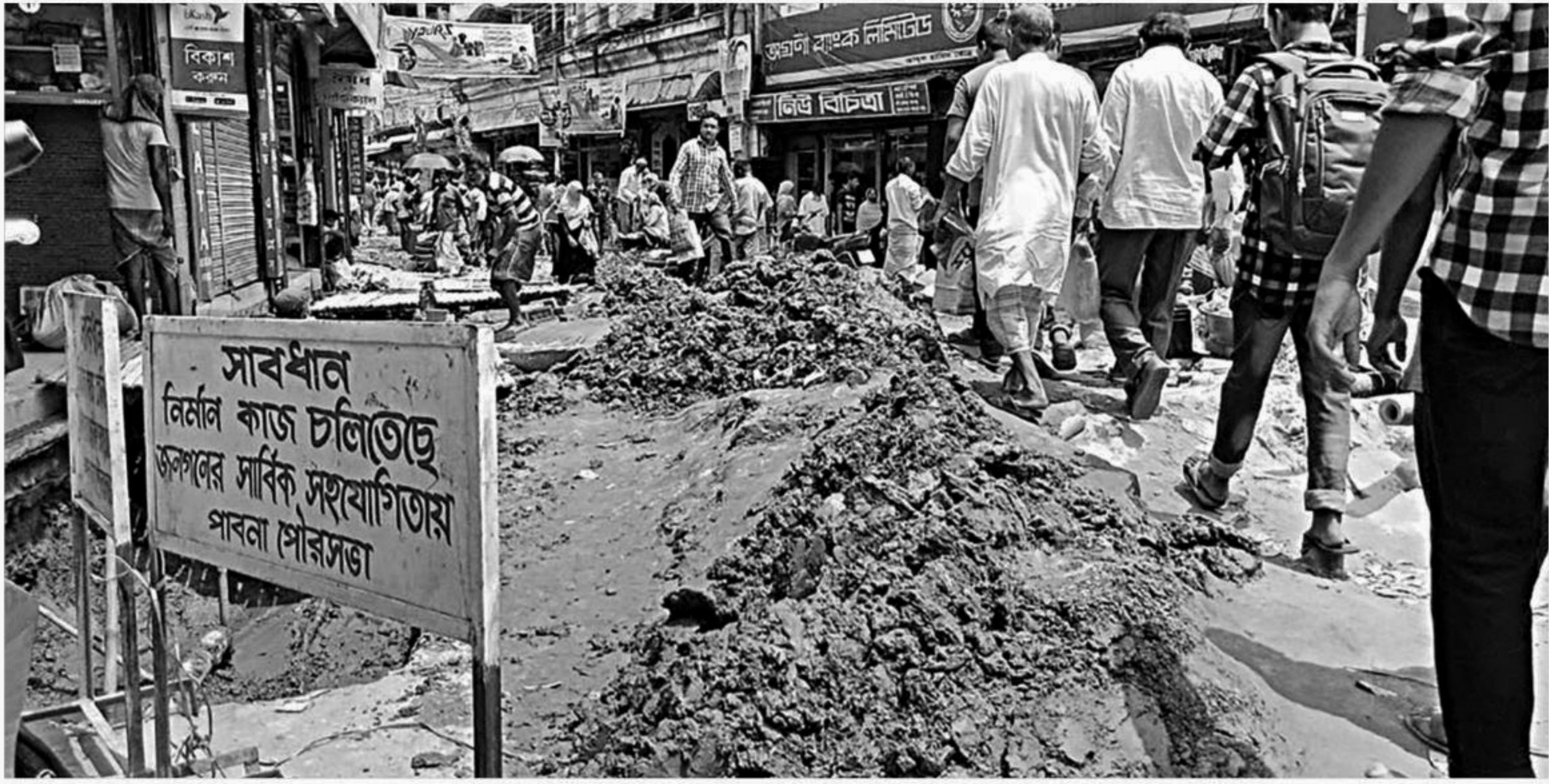
The main thoroughfare in New Market area of Pabna town remains covered with construction materials, much to the nuisance of pedestrians, especially shoppers ahead of the coming Eid-ul-Fitr.

"This is one of the key development projects of the municipality and is likely to end by December this year as the work will be extended to another key road," Tabibur said.