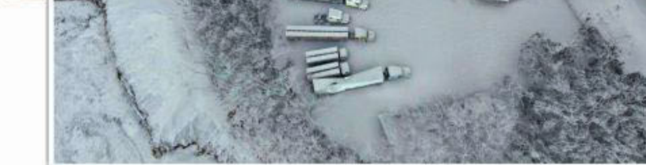
Residents carry coffins of people who died following the eruption of the Fuego volcano, along the streets of Alotenango municipality, Sacatepequez, about 65 km southwest of Guatemala City, on Monday. Inset, An aerial view of the ash-filled area around the volcano. Rescue workers pulled more bodies from under the dust and rubble left by an explosive eruption of Guatemala's Fuego volcano, bringing the death toll to at least 69.