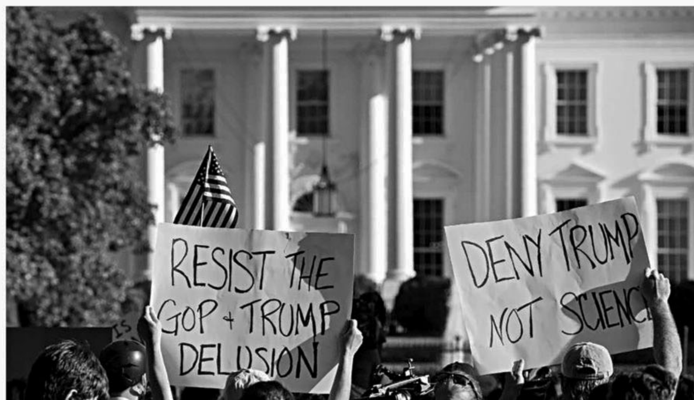
Americans protest President Trump's withdrawal from the Paris Agreement on Climate Change outside the White House in June 2017.

Perhaps the biggest shift that has taken place, which is not necessarily directly attributable to Trump's decision to withdraw from the Paris Agreement, is the inexorable global shift from fossil fuels to renewable energy.