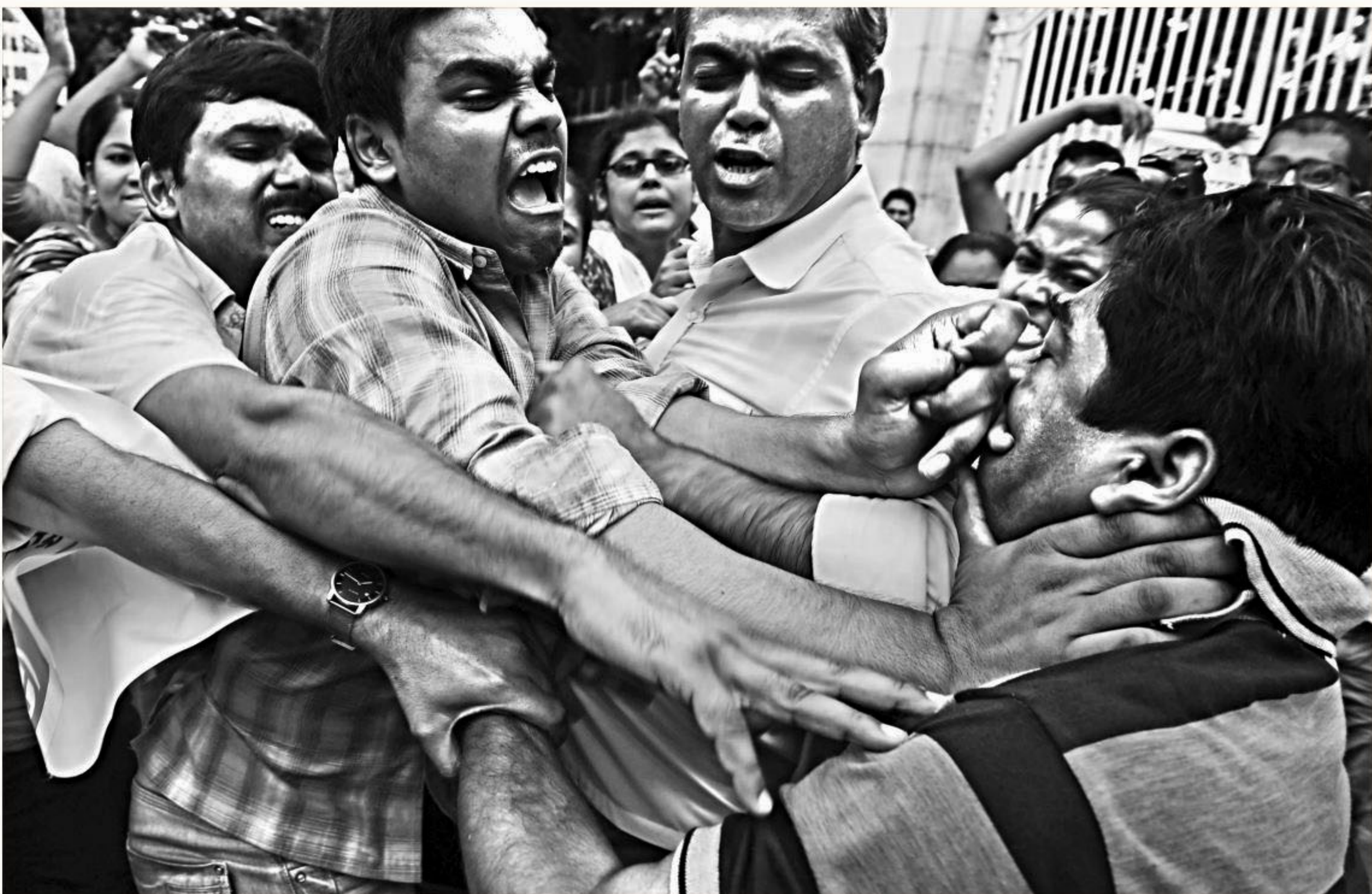
Indian leftist activists with the Socialist Unity Centre of India (SUCI) attack a plainclothes policeman (R) during a protest against the central government over high fuel prices, in Kolkata, yesterday. Protests across India were called in response to the increased cost of petrol and diesel, as high global crude oil prices were passed onto consumers.

Pakistan yesterday termed India's claim over Jammu and Kashmir as "spurious" and said it contradicts everything from history to the situation on the ground.