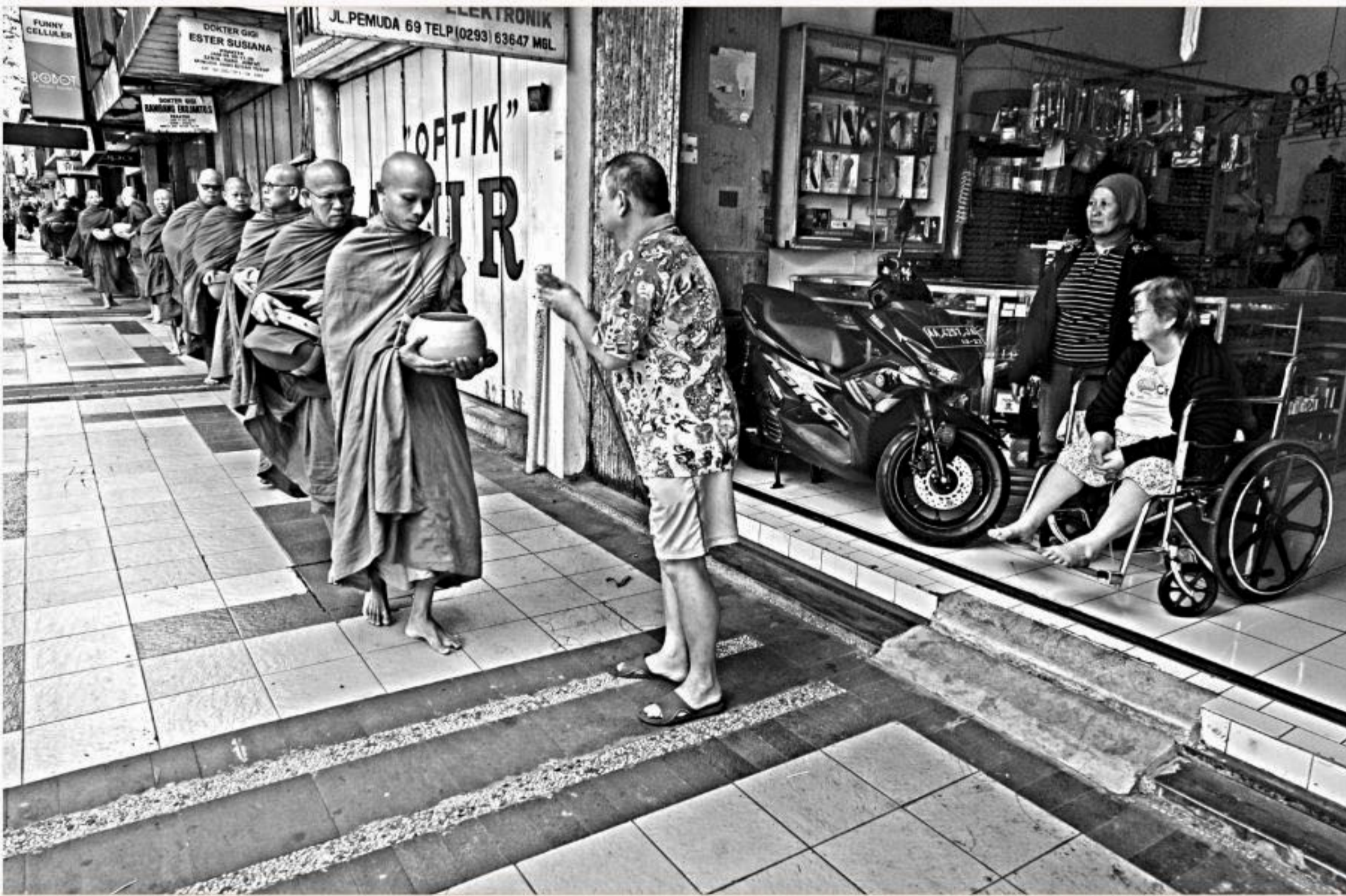
Buddhist monks collect alms one day before Vesak day in Magelang, yesterday. Buddhists in Indonesia mark Vesak Day on May 29 to celebrate the birth, enlightenment and death of the Buddha.

The July polls will bring to a head political tensions that have been mounting since former prime minister Nawaz Sharif was ousted by the Supreme Court on corruption charges last July and later barred from politics for life.