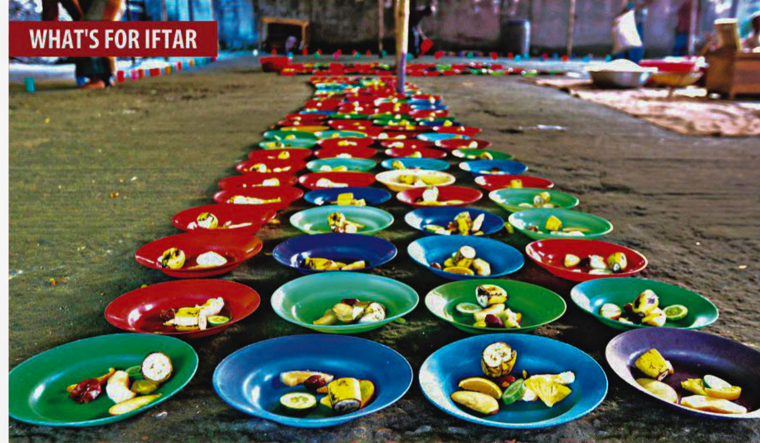
Slices of fruits on plates, creating colourful rows, laid down ahead of iftar. Every day during Ramadan, around 1,000 people from all walks of life gather at the High Court Mazar area in Dhaka to break their fast. The mazar committee organises this public iftar with donation from the well-off members of society. This photo was taken yesterday.