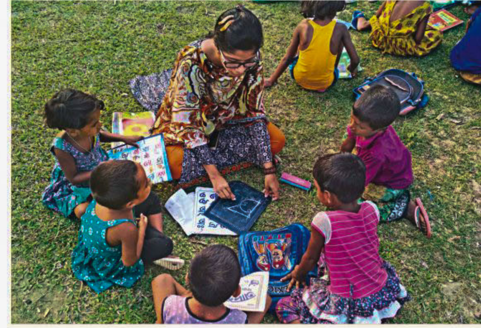
Students take lessons circling around a teacher at Shapno Puro Bidda Niketon in Barisal city's Tirish Godown area.

The founders of the school formed a voluntary organisation named