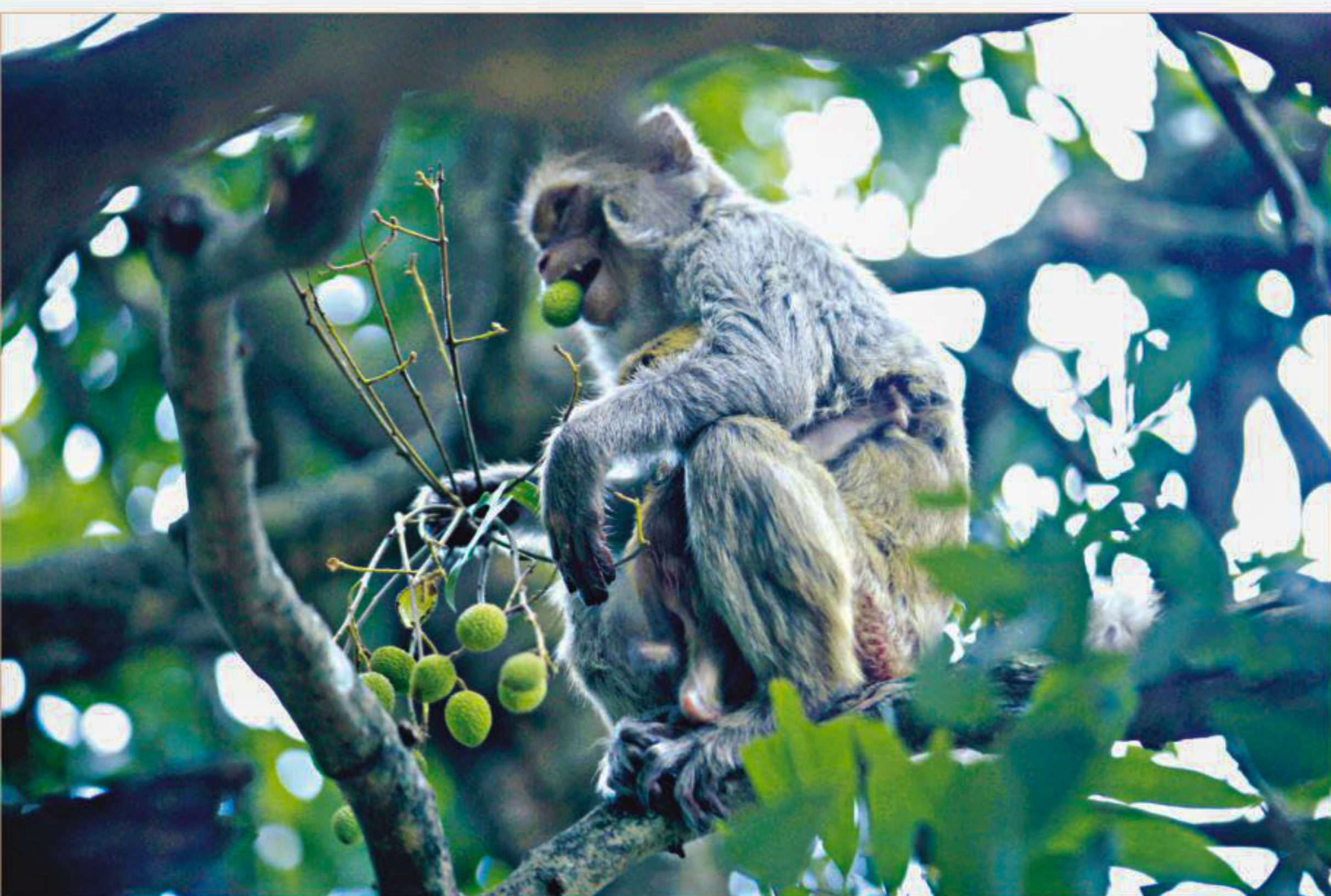
With summer here, lots of juicy fruits are available across the country. For many people, litchi is the most favourite fruit. Although a ripe litchi is what usually makes one's mouth water, this monkey cannot wait any longer and is seen eating a green litchi on a tree in Sylhet city's Ambarkhana area yesterday.