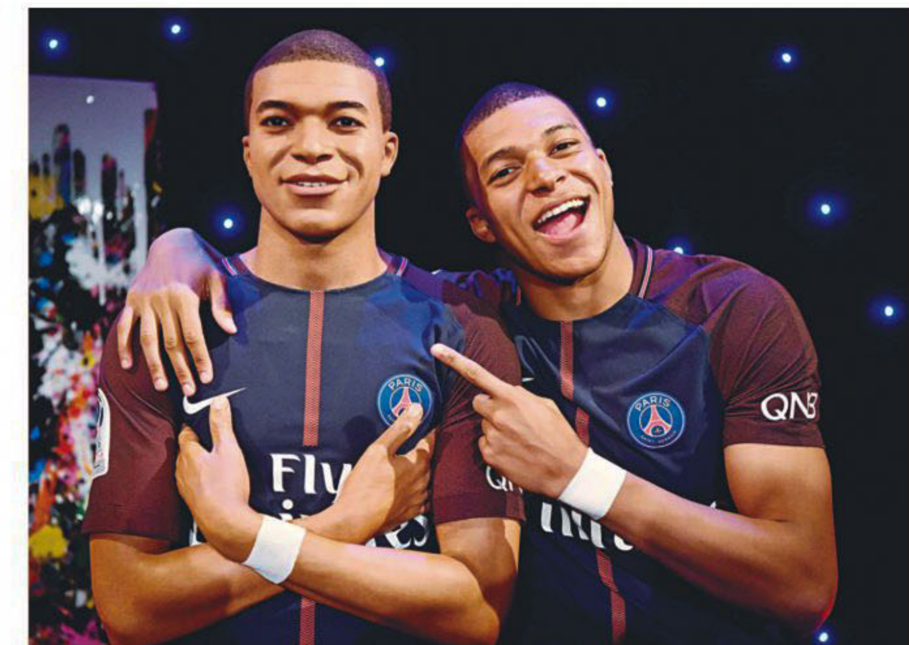
Kylian Mbappe had a waxwork unveiled at The Grevin Museum in Paris on Thursday, alongside which the 19-year-old Frenchman gleefully struck a few poses.