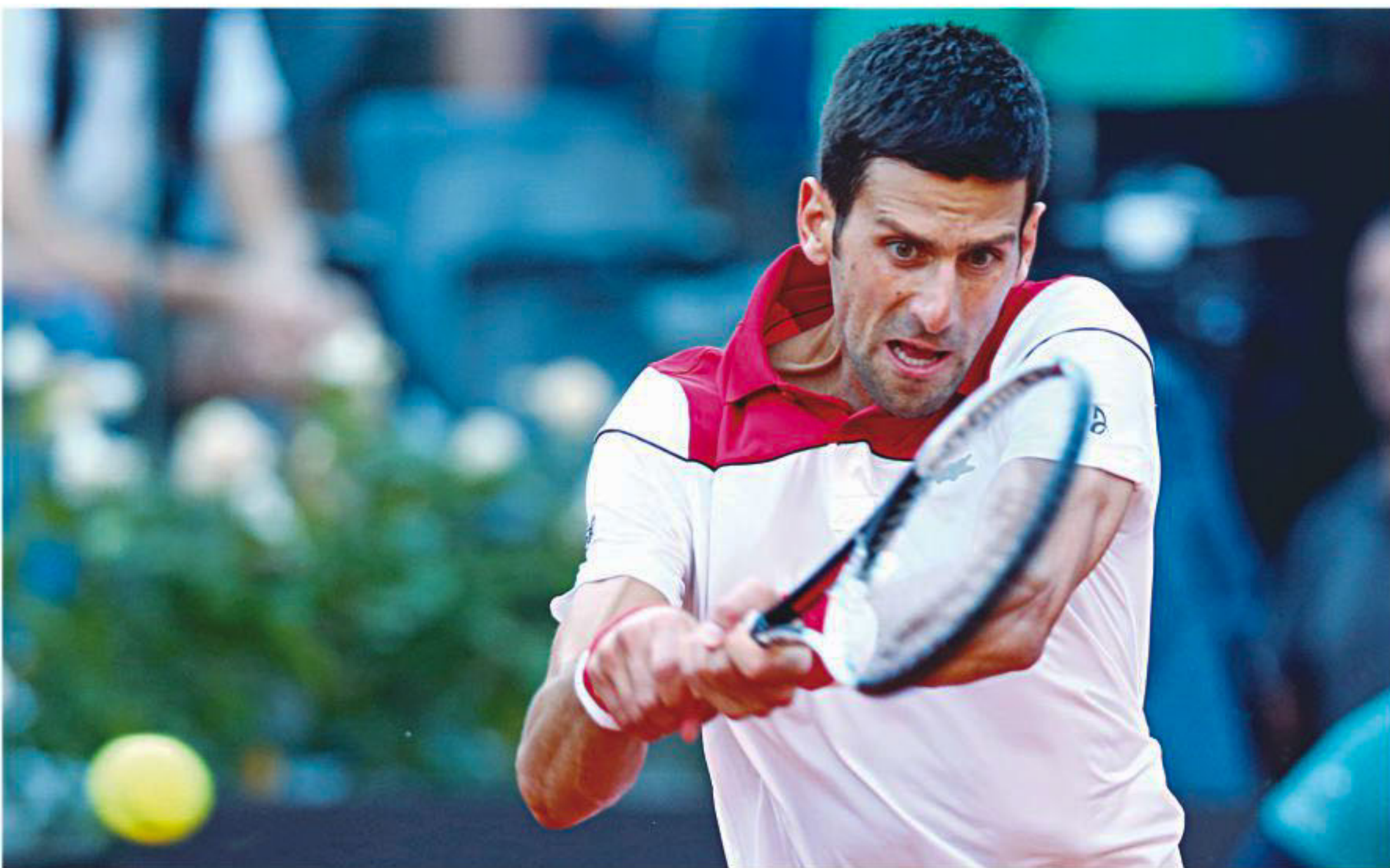
Serbia's Novak Djokovic showed his trademark fighting spirit while coming back from a set down to beat Japan's Kei Nishikori in the Italian Open quarterfinal at Foro Italico yesterday.

"It's great to start my managerial career at this level but for me the most important final of the Champions League is this one, not the last one. We have to give it everything."