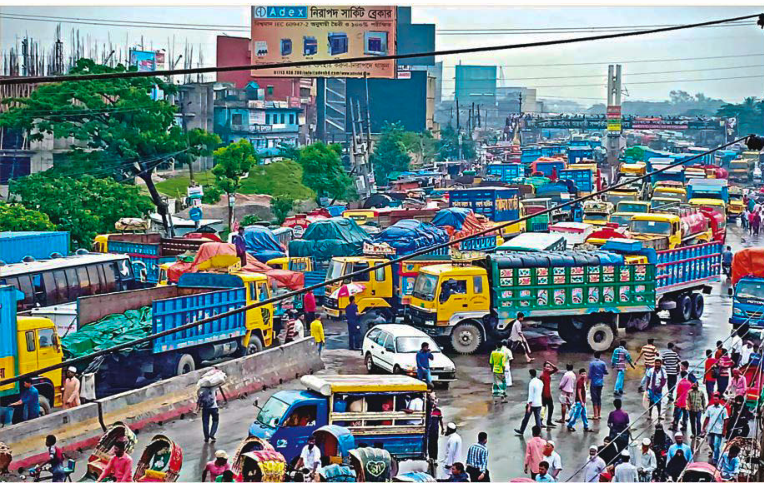
Vehicles stuck in traffic near Shimrail area of Narayanganj on Dhaka-Chittagong highway yesterday morning. Motorists said bottlenecks due to a stretch of narrow road near Kanchpur Bridge and poor parking were largely responsible for the situation.