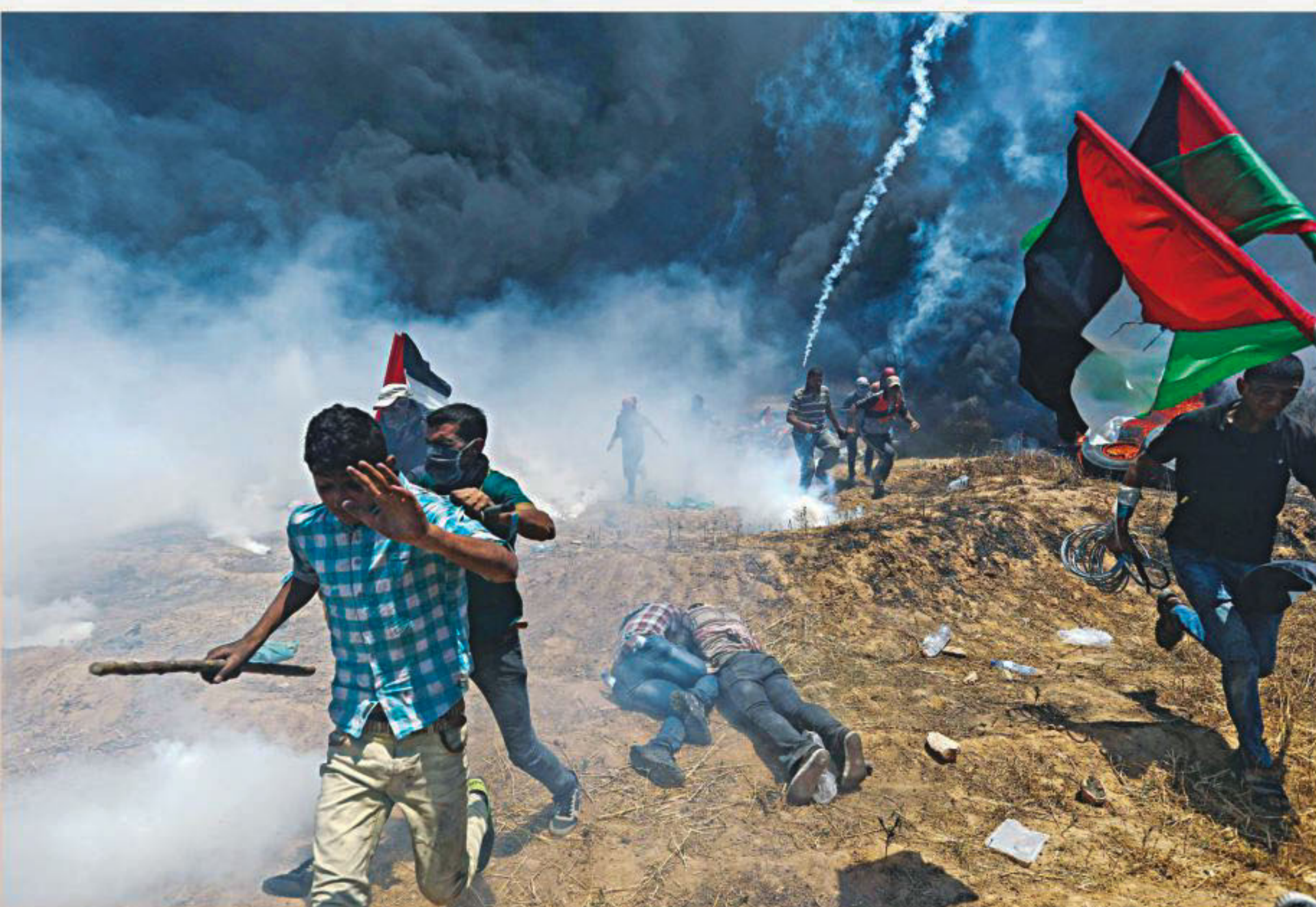
Palestinian demonstrators run for cover as Israeli forces fire teargas shells during a protest against the shifting of the US embassy to Jerusalem. The picture was taken at the Israel-Gaza border in the southern Gaza Strip yesterday.