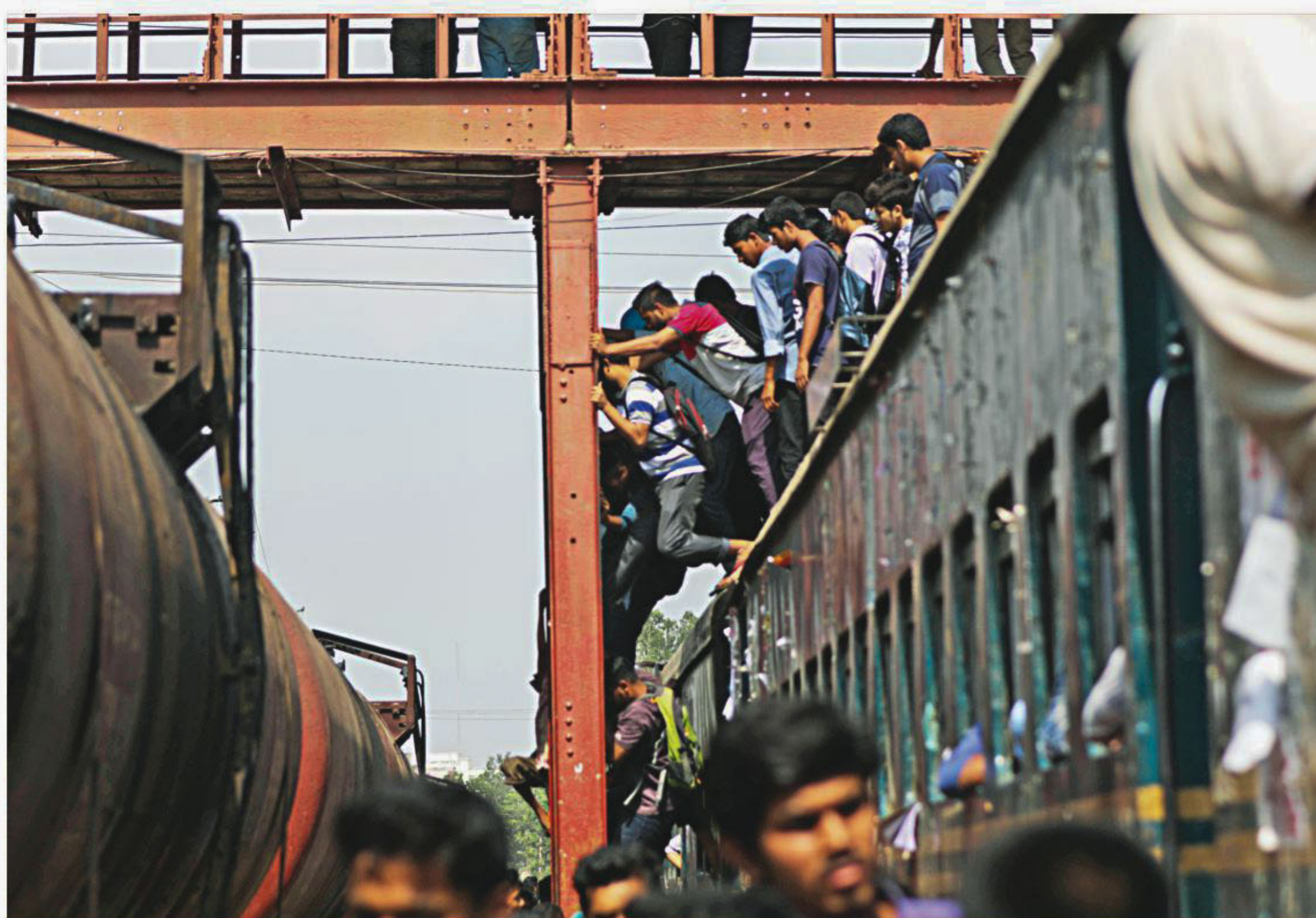
Chittagong University students climbing down from their shuttle train at Sholashahar Railway Station yesterday. Sometimes due to lack of room inside carriages, and sometimes just for fun, they travel on the roofs of the train knowing very well that an accident could result in serious injuries and even death.