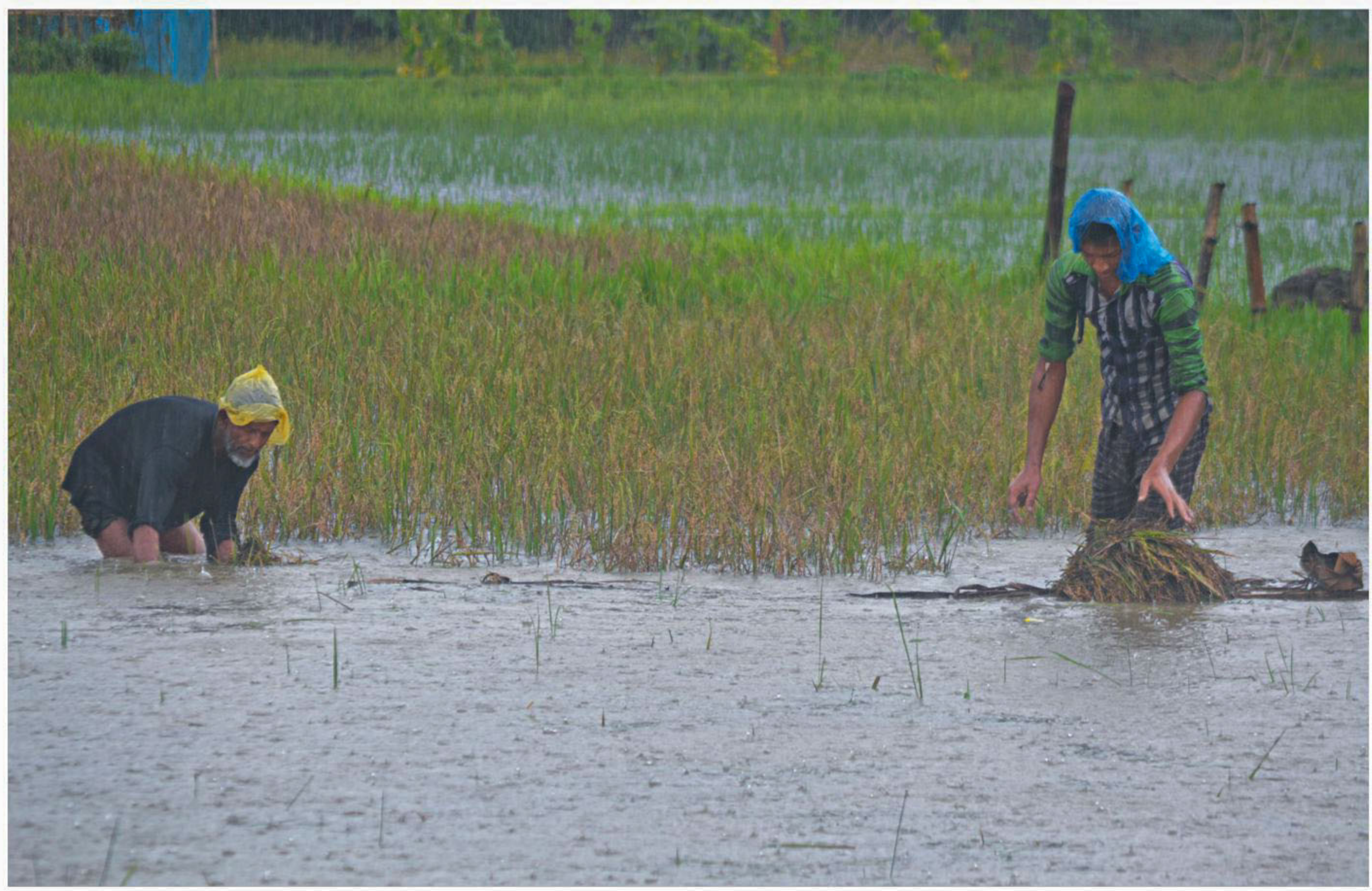
Continuous rain with gusty wind during the last couple of days flattened standing Boro crops on vast lands in Hakaluki Haor area, creating panic among the farmers who incurred huge losses due to recurrent natural disaster last year. The photo, taken from Kadipur in Kulaura upazila of Moulvibazar yesterday, shows farmers reaping nearly ripe paddy at an inundated field.

"During primary interrogation, Helal confessed to the rape and he was sent to jail through a court today [Monday]. The victim was sent to Pabna Medical College Hospital for medical examination, the OC said.