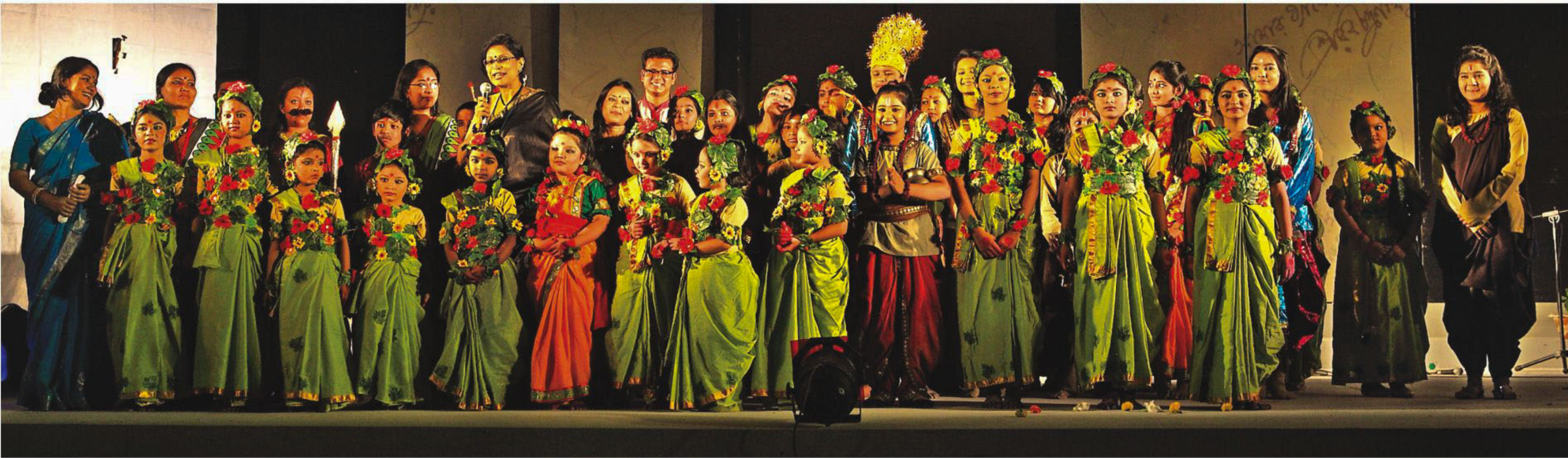
Children performing during a Shurer Dhara event