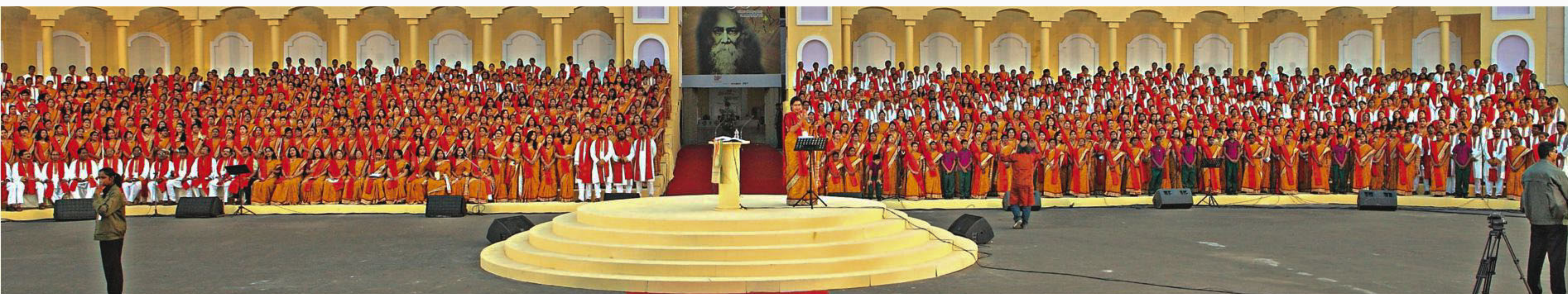
A thousand voices singing the melodies of Tagore