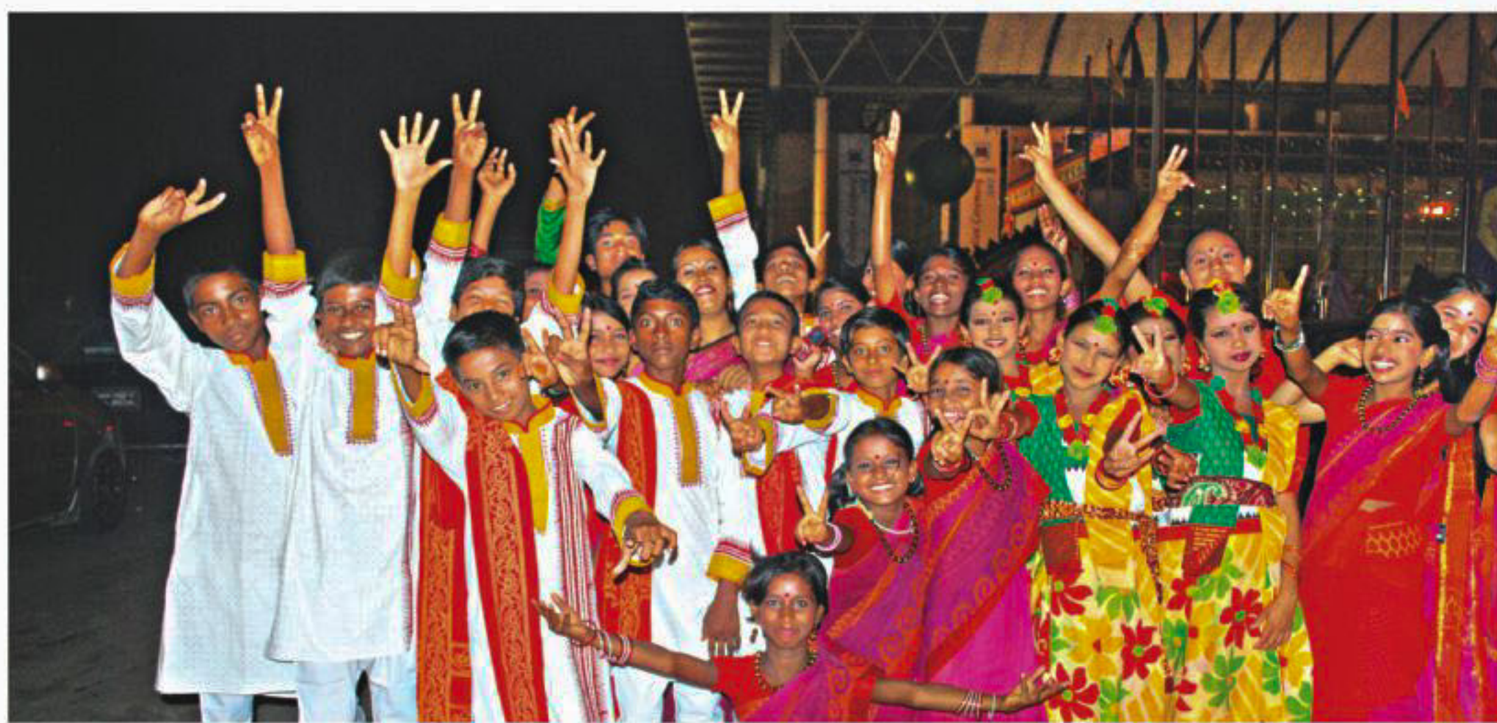
Program for the children under the Music for Development project