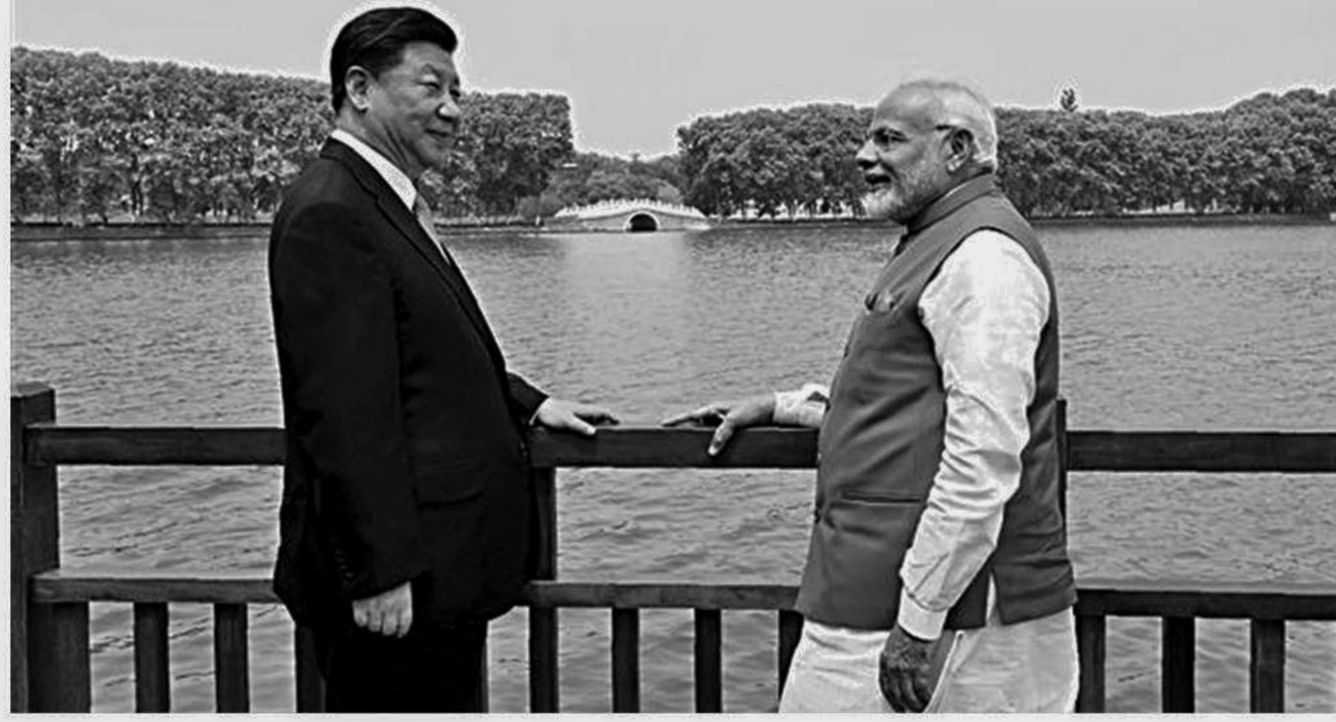
Photograph released by India's Press Information Bureau on April 28, shows India's Prime Minister Narendra Modi and Chinese President Xi Jinping looking out along the East Lake, in Wuhan.

Such a historical hindsight among Chinese and Indian leaders (Great Silk Route for China, Hindustva for India), is a luxury for rivals: the United States does not have a deep enough history to draw upon, and even if it did, its policymakers have rarely invoked it upon foreign policy; Russia cannot look back because of the bitter and barbaric experiences it holds; while France, Germany, and Great Britain possess rich and relevant such reservoirs, yet do not steer the strategic