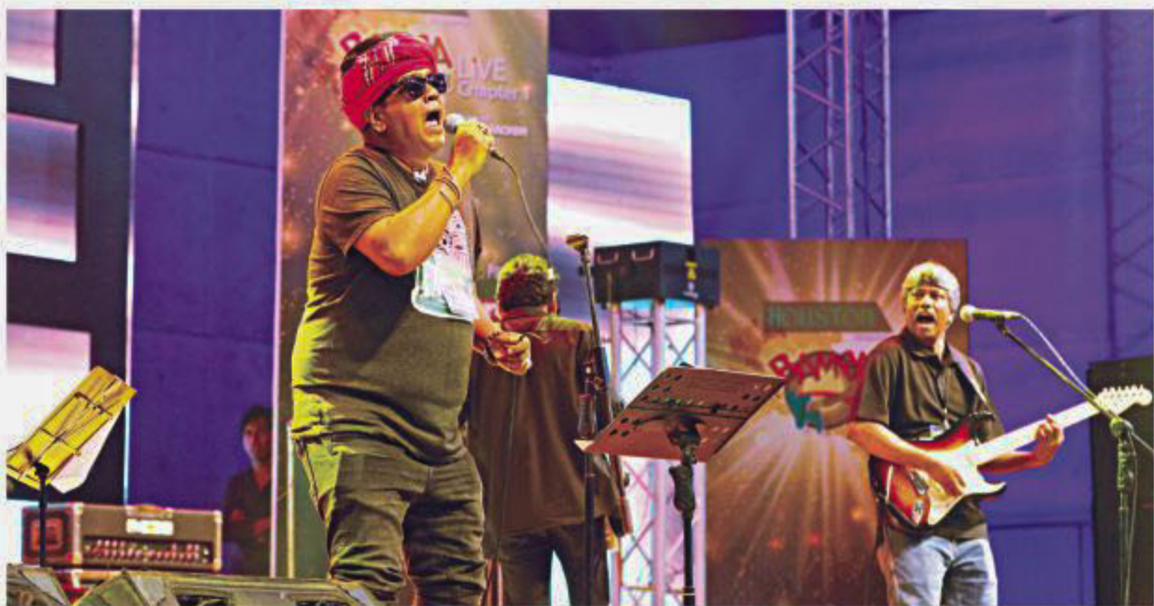
Mac and Feedback