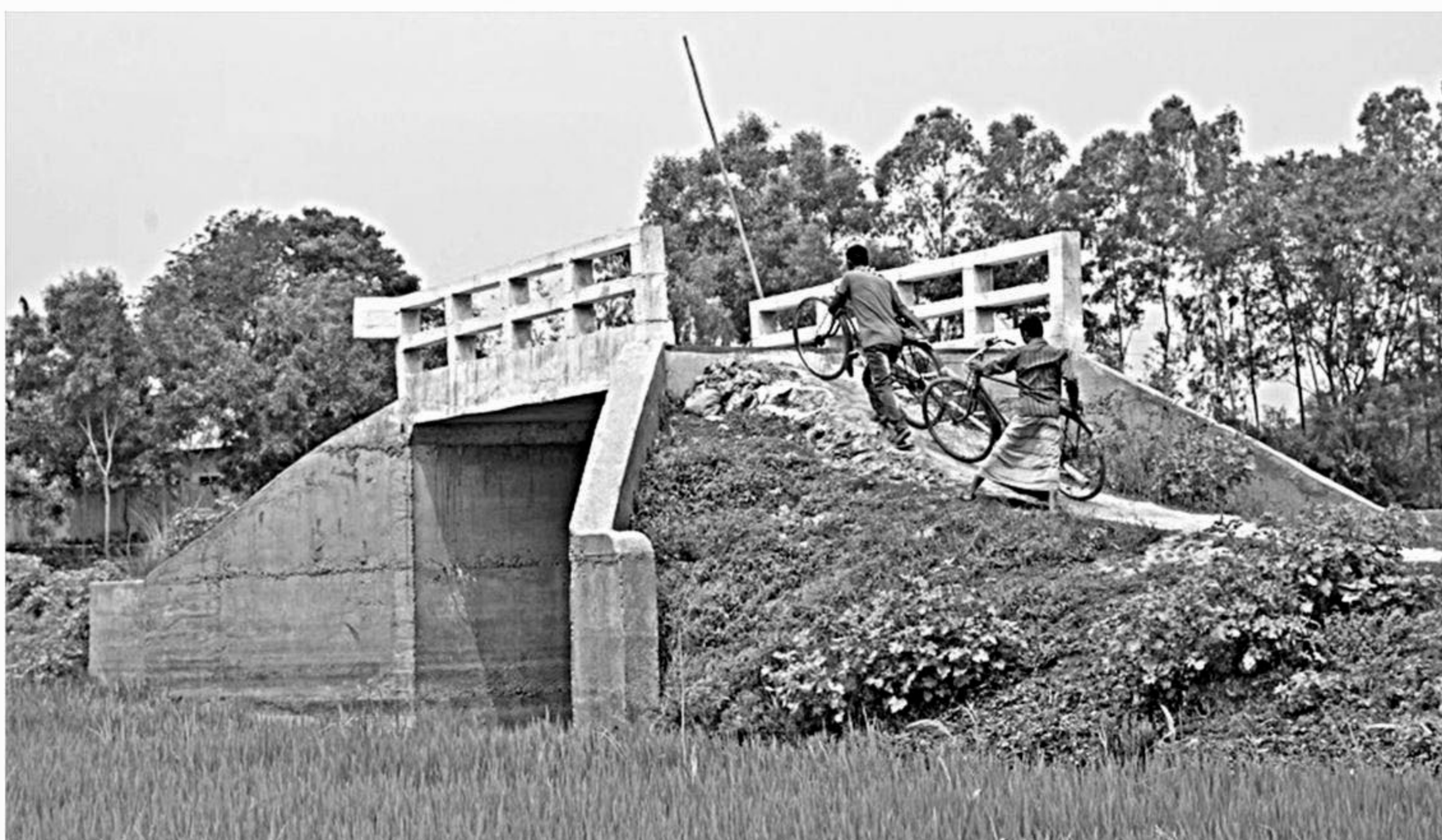
The approach roads to the bridge from Mamudnagar village to Postkamari village in Shikderbari area under Nagarpur upazila of Tangail are in awful condition due to lack of proper earth-filling work.

"The situation started improving just after deployment of traffic police at the bus stand. I want to thank the SP as he has kept his promise within a very short time," he added.