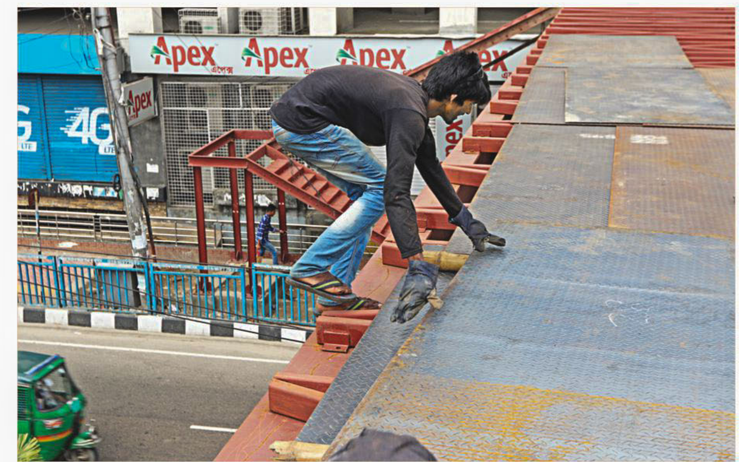
Foot over-bridges are an integral element of road safety in the capital, but those constructing it are working without safety measures of their own. A worker is seen busy erecting a foot over bridge in the capital's Kazi Nazrul Islam Avenue without any safety harness or scaffolding, hanging dangerously right above busy traffic. The photo was taken yesterday.

An accounts officer of the Water and Sewage Department (WASA), Nishat Majumdar became the first Bangladeshi woman to climb Mount Everest, the highest summit in the world on May 19, 2012.