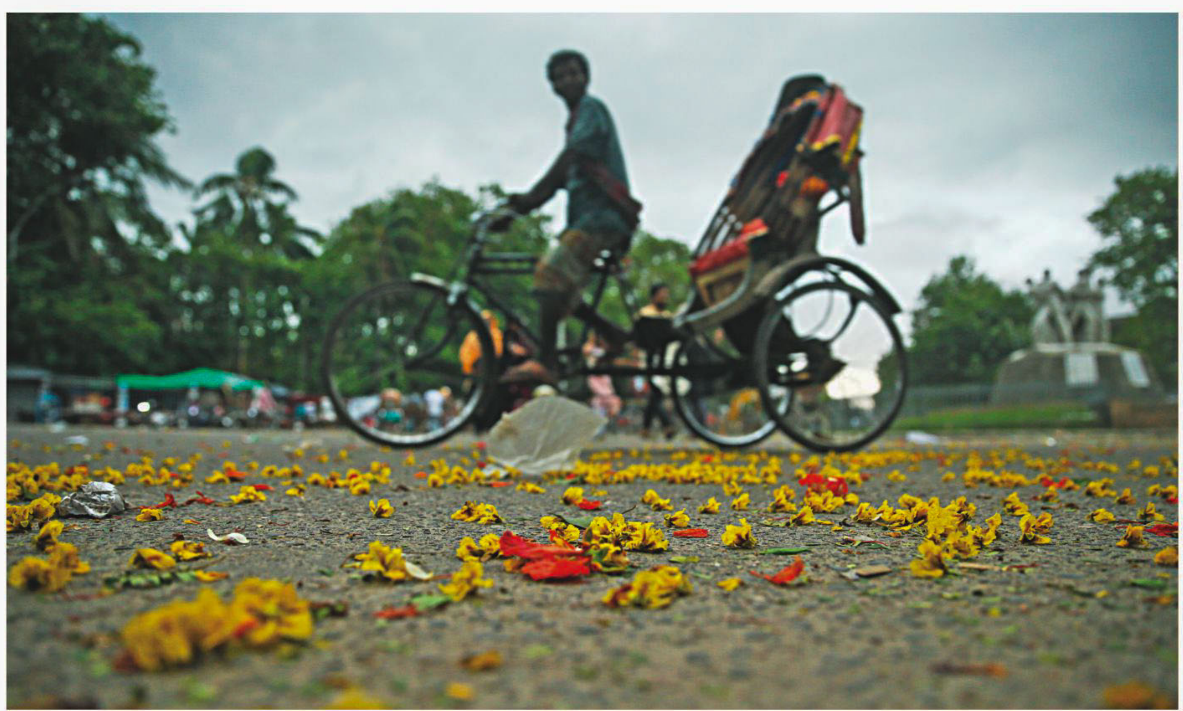
Summer is when Dhaka streets take on the hues of nature. Set against a gloomy sky, the red and yellow flowers seem to set the street ablaze. The photo was taken yesterday near TSC, Dhaka University.

Asked that he bought wealth under his relatives' names to SEE PAGE 4 COL 3