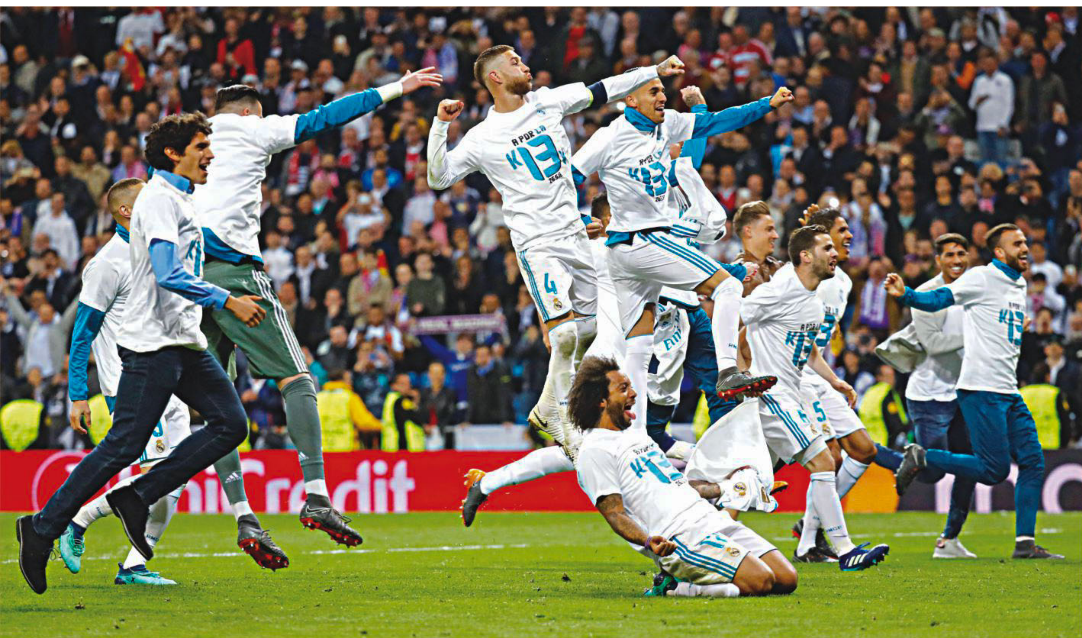
The Real Madrid players held nothing back in their celebrations after grinding out a 2-2 draw against Bayern Munich in the second leg of their Champions League semifinal on Tuesday night. Los Blancos won the tie 4-3 on aggregate and advanced to their third straight final.