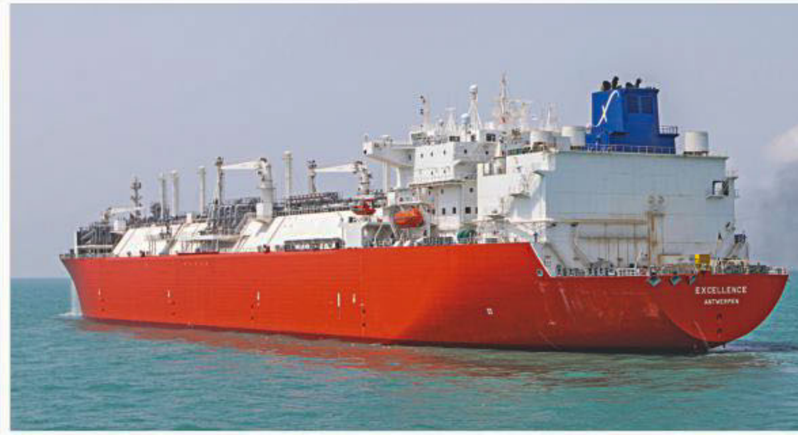
Excellence, which carries Bangladesh's first imported LNG, is anchored in Bay.

MOHAMMAD SUMAN, back from Mohehkhali The ship carrying Bangladesh's first import consignment of liquefied natural gas has anchored in the Bay of Bengal, with the help of which LNG supply to the national grid is scheduled to begin next month. The vessel—Excellence—which brought in 1.37 lakh cubic feet of LNG from Qatar will be permanently attached with the base station or the LNG terminal. Excellence will also work as a floating storage and re-gasification unit. Gas will be stored here for import through other vessels later. Another week is required to prepare the base station to start gas commissioning, said Md Tajul Islam, chairman of the parliamentary standing committee on power, energy and mineral resources ministry.