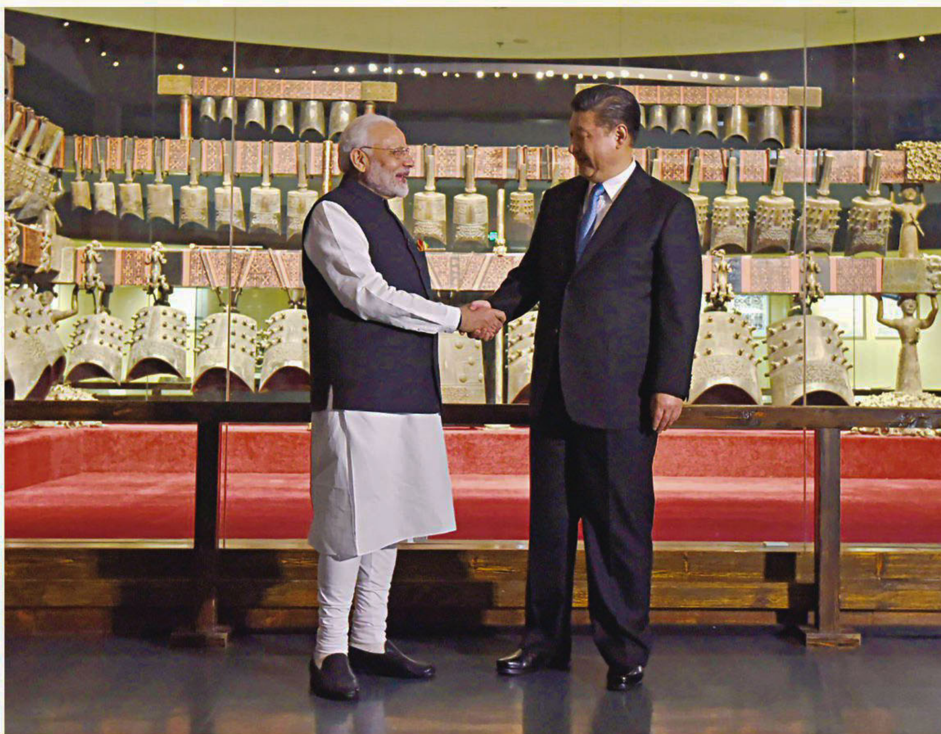
India's Prime Minister Narendra Modi shaking hands with Chinese President Xi Jinping at Hubei Provincial Museum, in Chinese city of Wuhan, in a handout photograph released by India's Press Information Bureau yesterday.