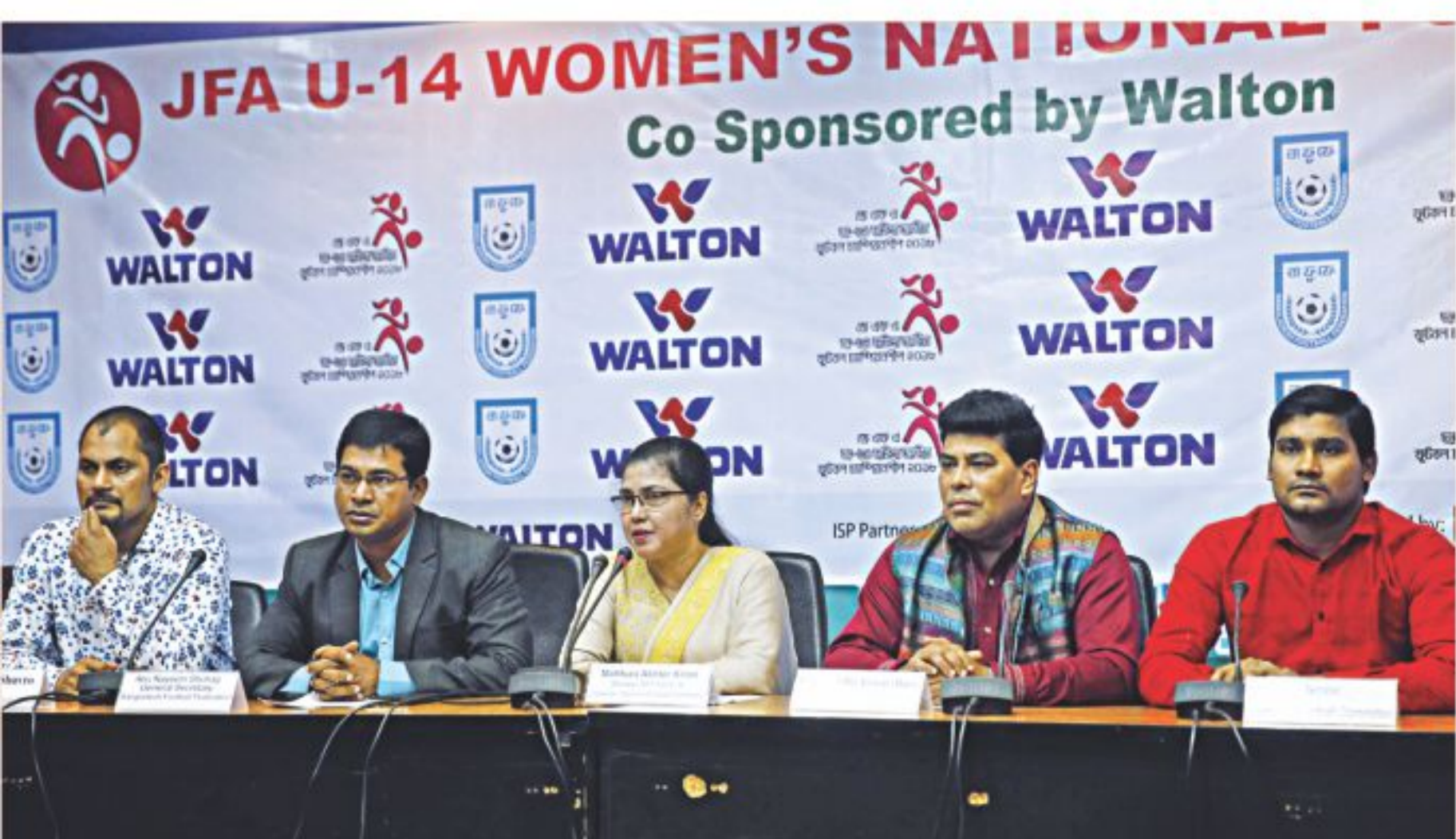
Organisers and sponsors speak at a press conference at the BFF House yesterday ahead of the JFA U-14 Women's National Football Championship, which gets underway tomorrow.

Preliminary round matches at the Gopalganj, Nilphamari, Rajshahi, Laxmipur and Khulna venues will start tomorrow while the matches of Gazipur venue will begin on April 25.