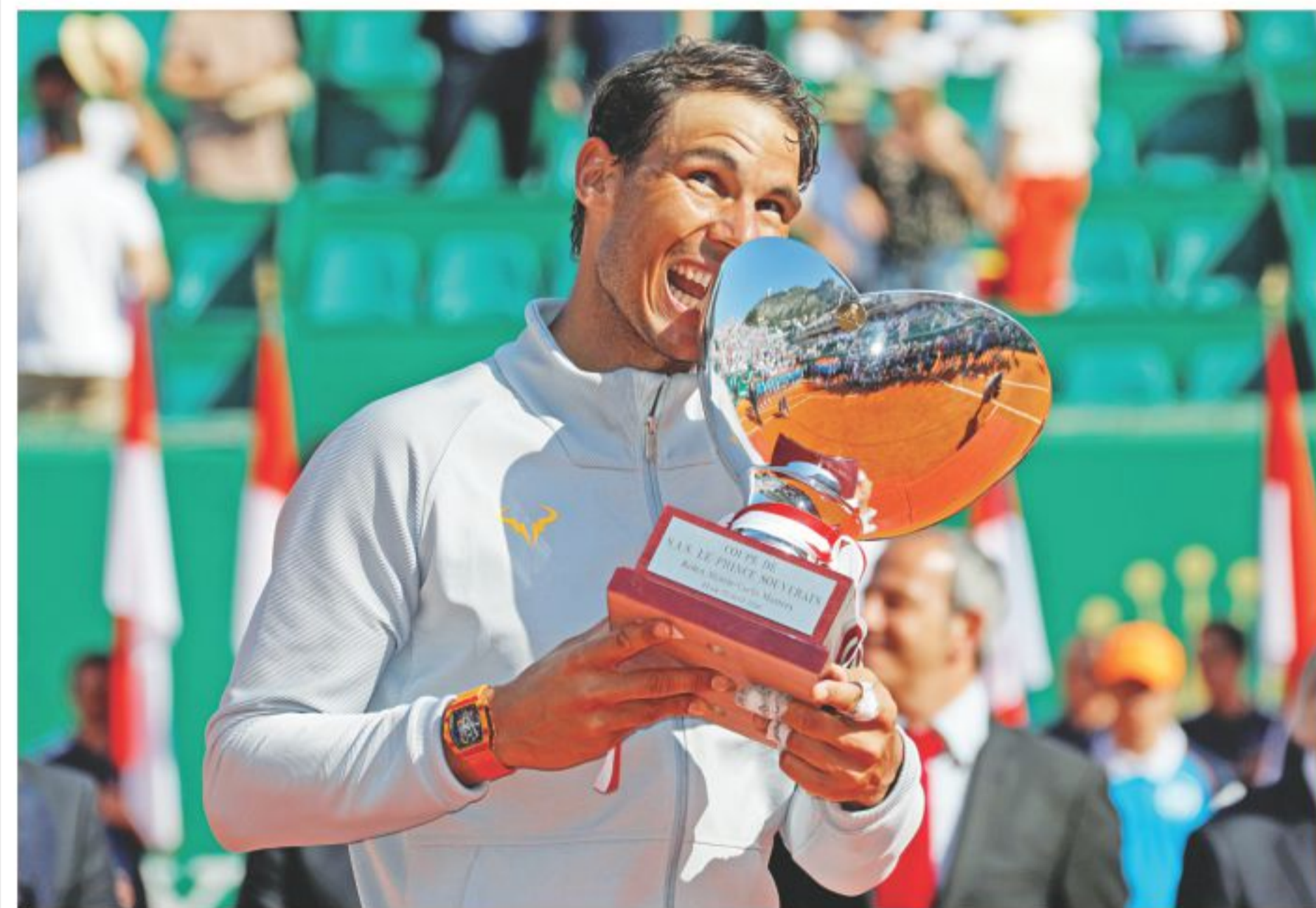
World No. 1 Rafael Nadal takes a bite of his delicious 11th Monte Carlo Masters trophy after pouncing Kei Nishikori 6-3, 6-2 in the final yesterday.

That will be Chelsea's last chance to win major silverware at the end of a troubled season. But Conte doesn't believe Chelsea, beaten by Arsenal 2-1 in last year's final despite going into the match as Premier League champions, will be regarded as favourites to lift the famous trophy.