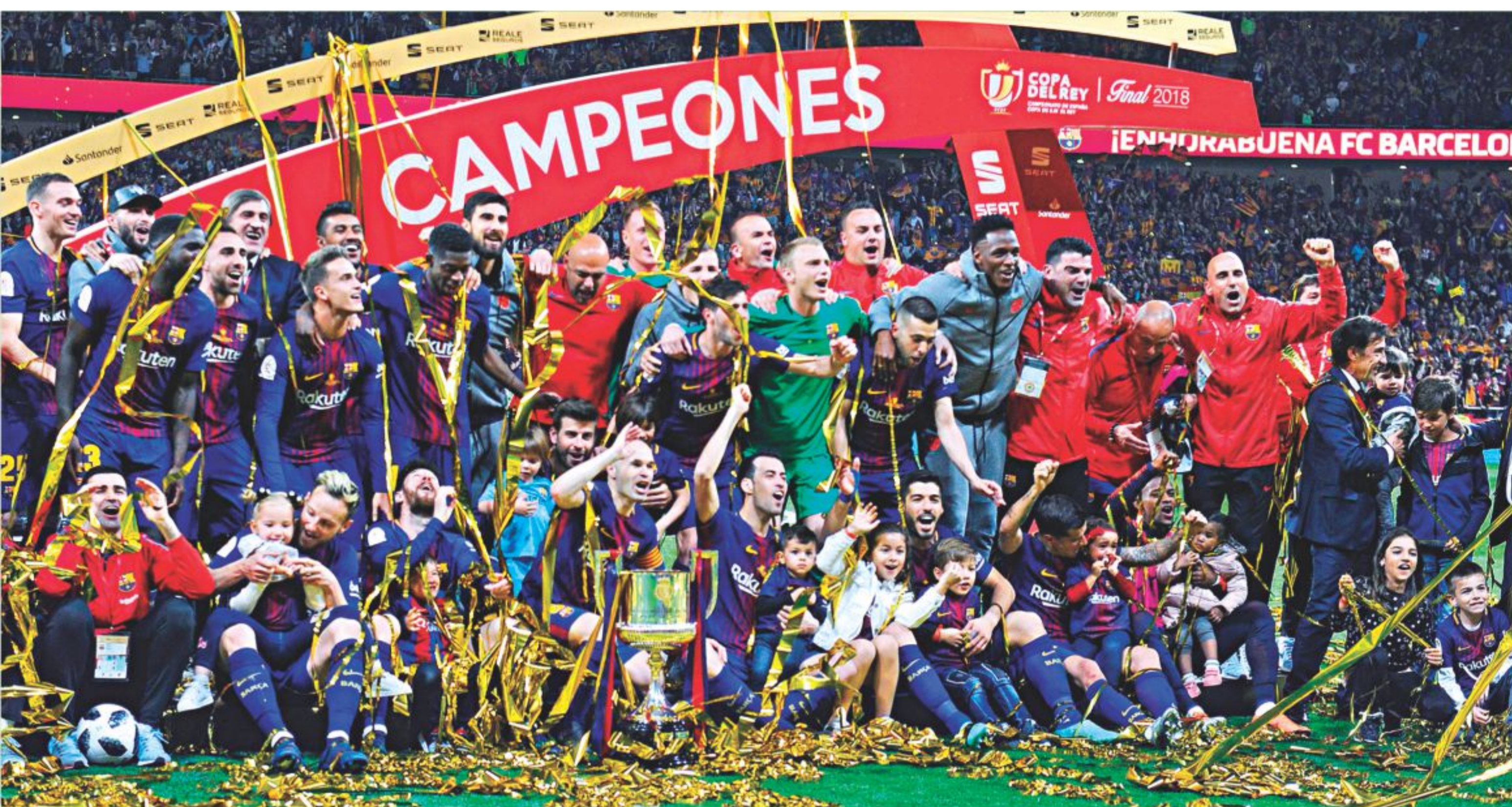
Barcelona players turned their post-game celebrations into a family affair as the squad brought out their children to celebrate a fourth Copa del Rey title in as many years. The Blaugrana can now turn their focus to La Liga, where they are aiming for an unprecedented undefeated season.