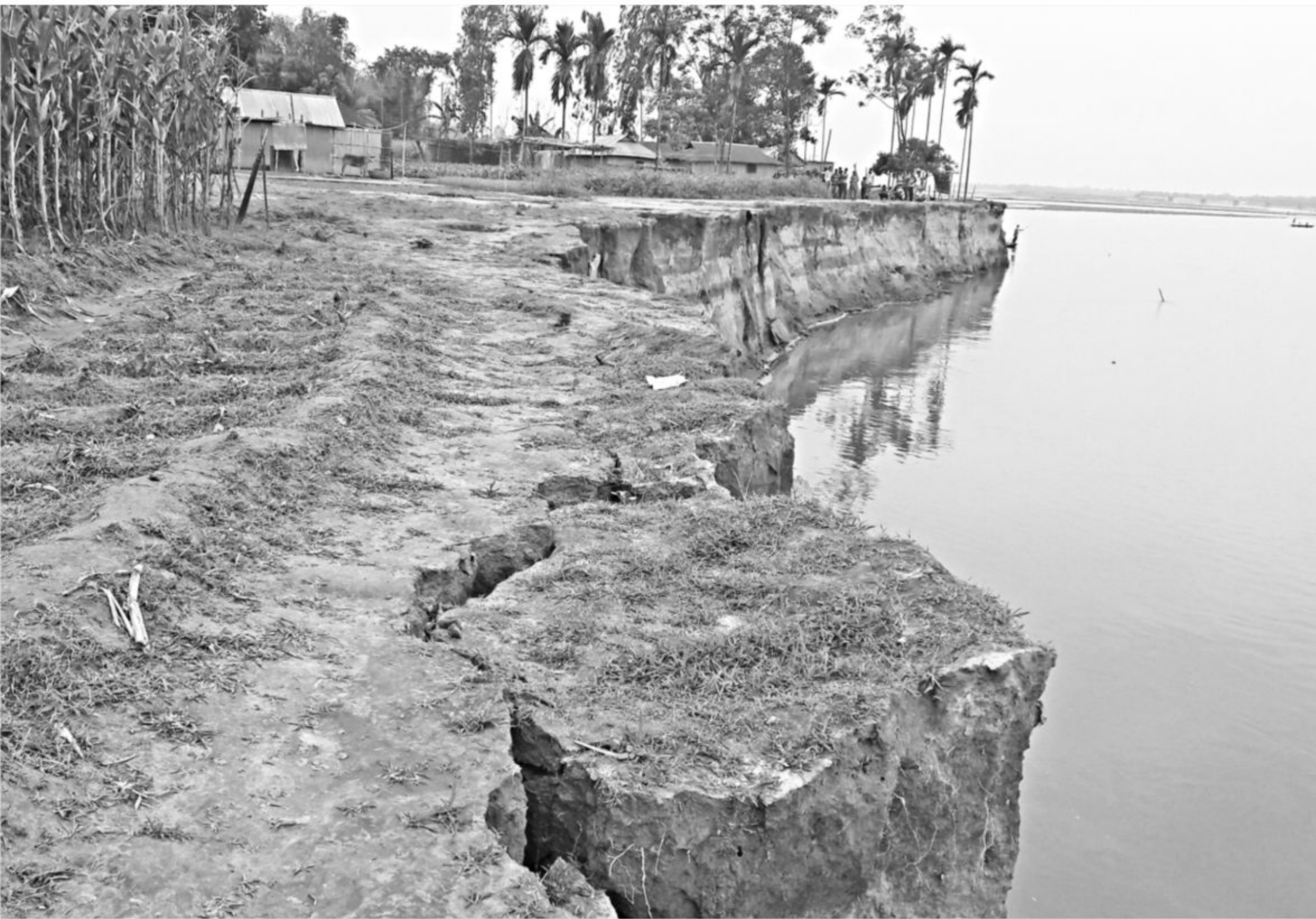
Chunks of land fall into the Dharla at Badaitari village in Mogholhat union of Lalmonirhat Sadar upazila as erosion by the river continues. The photo was taken on Saturday.