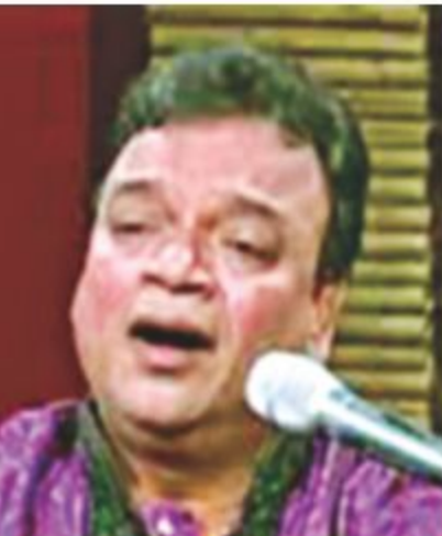
Abu Bakr Siddique