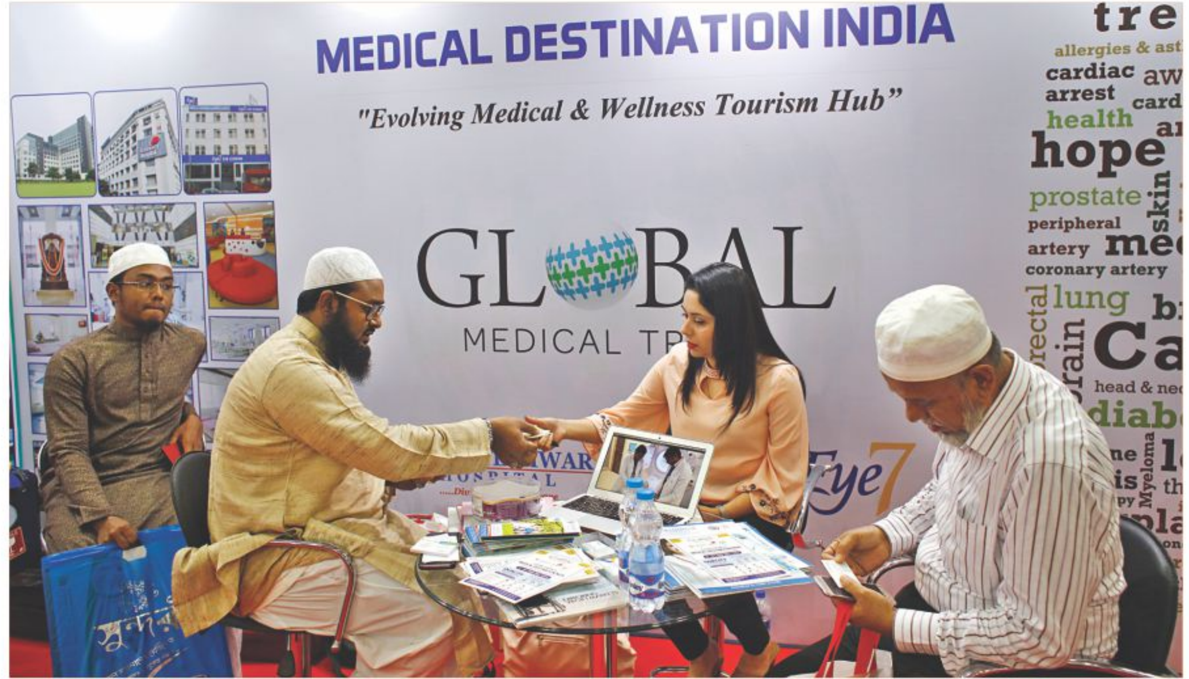
A stall attendant briefs visitors on services at the three-day international tourism fair that began yesterday at Bangabandhu International Conference Centre in Dhaka.