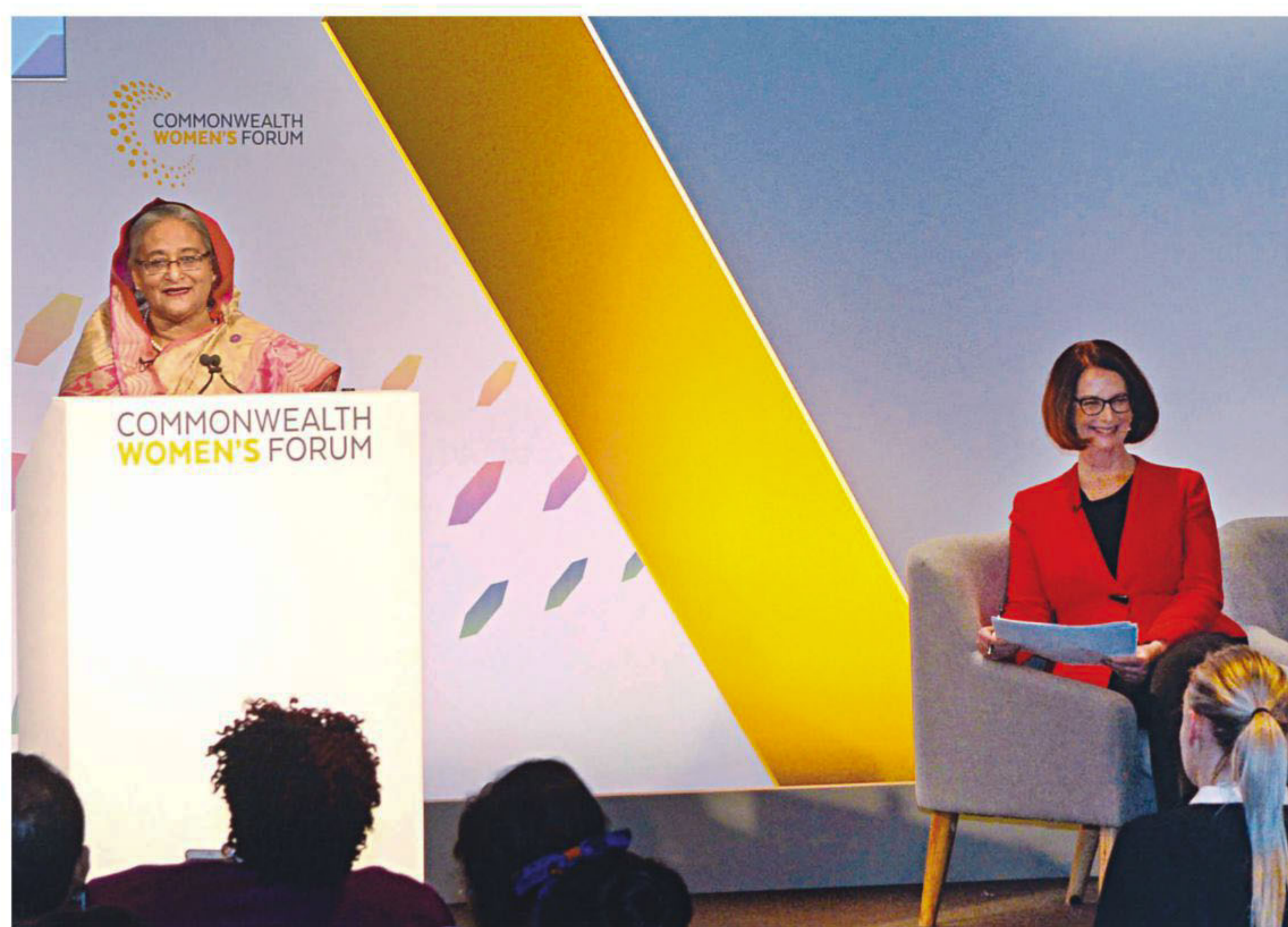
Prime Minister Sheikh Hasina is addressing a discussion on "Educate to empower: Making equitable and quality primary and secondary education a reality for girls across the Commonwealth" at Queen Elizabeth II Conference Centre in London yesterday.

STAR REPORT Five people, including three alleged robbers, were killed in "shootouts" with law enforcers in Dhamrai, Brahmanbaria, and Rajbari yesterday. In Dhamrai on the outskirts of the capital, three suspected robbers were killed in what the Rapid Action Battalion claimed to be a gunfight. The deceased aged between 30 and 40 were yet to be identified. Col Anowar Zaman, company commander Rab-2, said a gang of seven robbers on three motorcycles were preparing to rob Tk 60 lakh of an NGO in Kelea area. The money was about to be deposited in a local bank, he said. Following a tip-off, a team of Rab-2 rushed to the area. The alleged robbers first tried to flee but started firing at Rab members when being chased. The Rab team retaliated with gunfire, said Col Anowar, adding that later three were found lying on the spot with bullet injuries. Doctors at Dhamrai Upazila Health Complex declared the three dead on arrival. Three pistols and some bomb like objects were recovered from the spot, he said. Rab said they believe the deceased were members of a gang called Rashid Bahini. In Brahmanbaria, a man was killed in a "shootout" near Akhaura Titas Railway Bridge early yesterday, hours after he SEE PAGE 10 COL 4