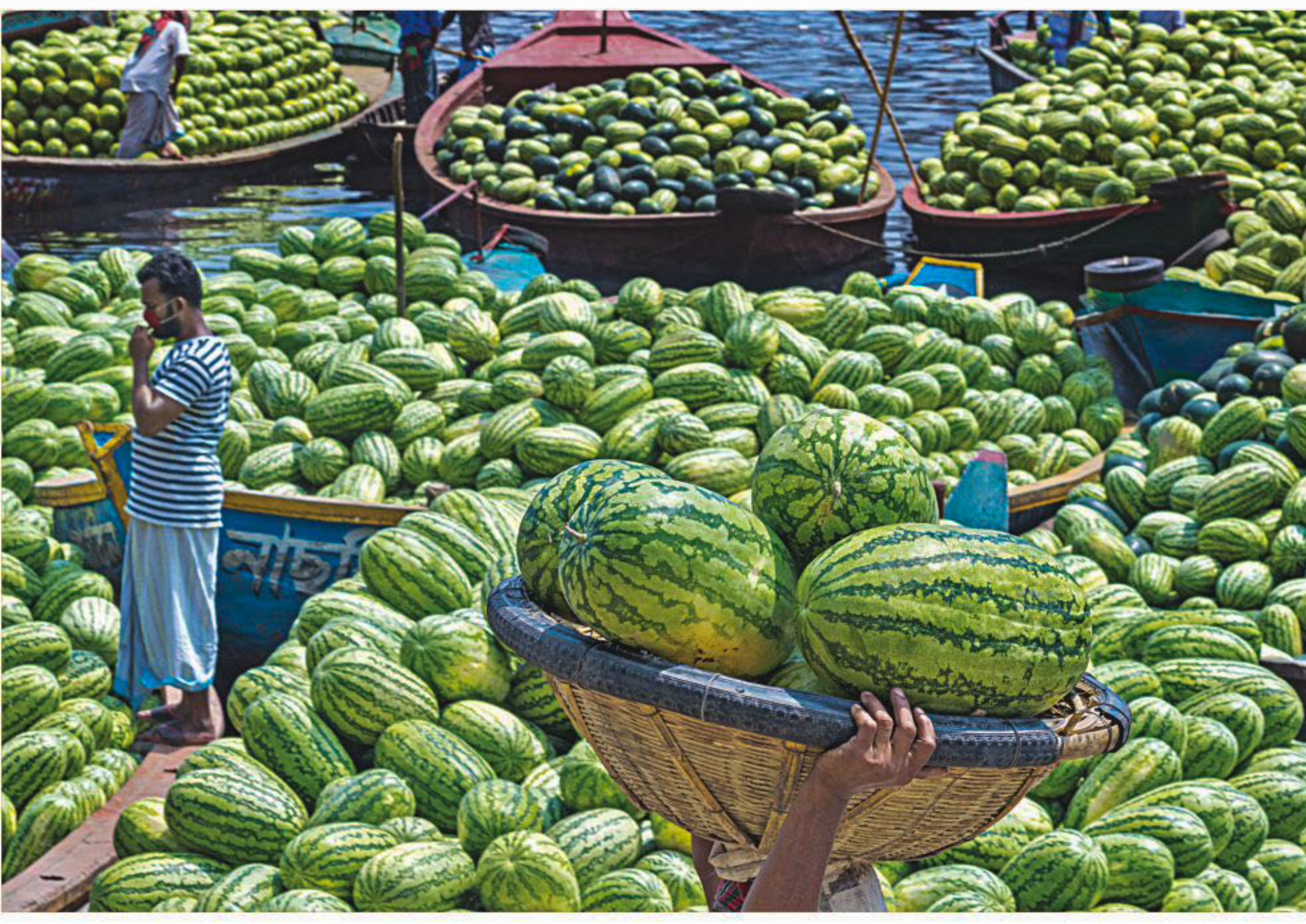
Watermelons from across the country arrive in boats at Waiz Ghat on the Buriganga in the capital. The summer fruit is in season now and it is flooding the city markets. A number of consumers said the prices are still higher than they had hoped.