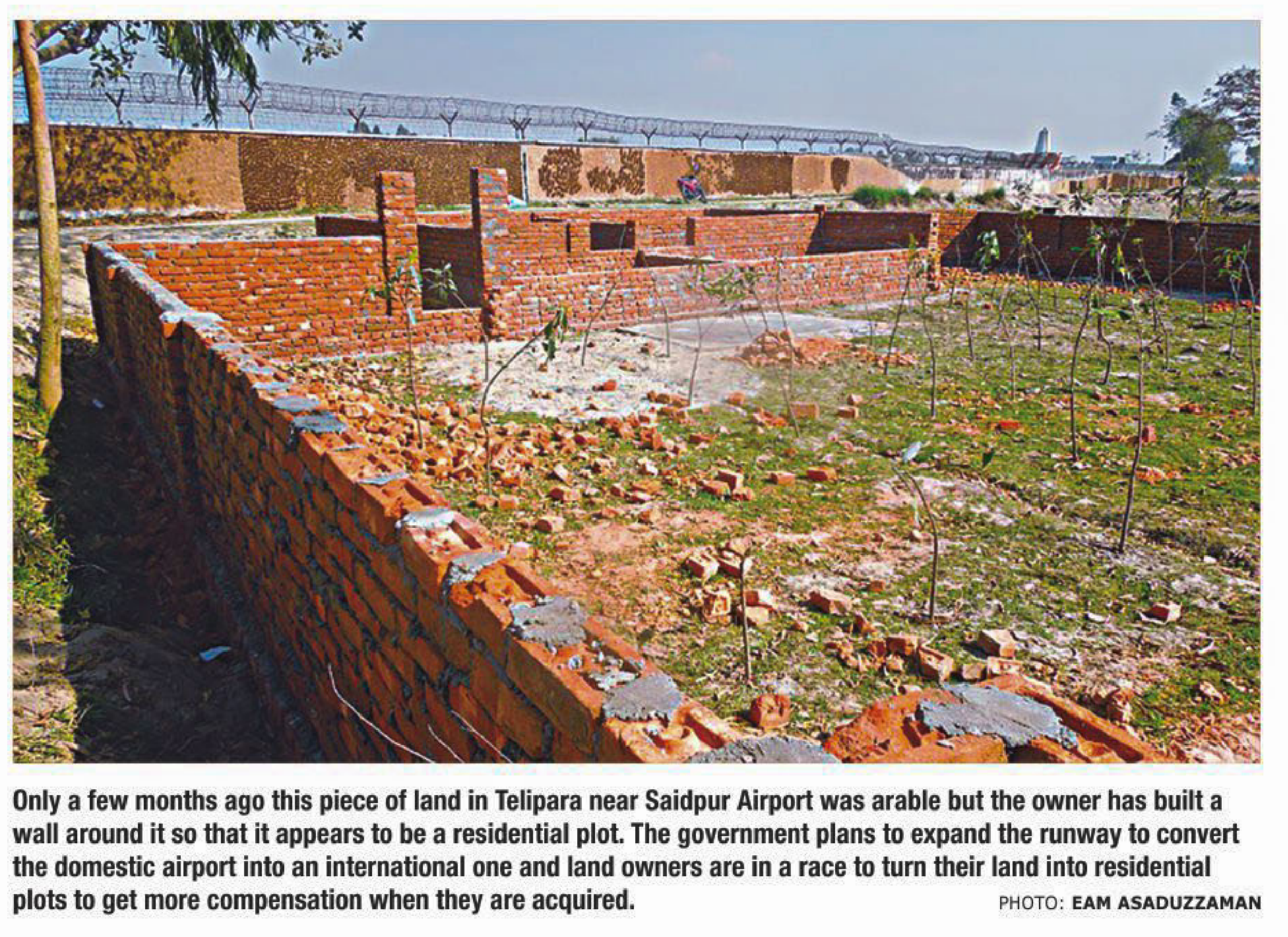
Only a few months ago this piece of land in Telipara near Saidpur Airport was arable but the owner has built a wall around it so that it appears to be a residential plot. The government plans to expand the runway to convert the domestic airport into an international one and land owners are in a race to turn their land into residential plots to get more compensation when they are acquired.

Mujibnagar Day today BSS, Dhaka The nation is observing the historic Mujibnagar Day today to recall the oath-taking of the country's first government in 1971. President Abdul Hamid and Prime Minister Sheikh Hasina yesterday issued messages, marking the day. In his message, the president said the country had achieved independence through a nine-month struggle on December 16, 1971 under the leadership of the Mujibnagar government. Nations from across the world had extended their support and cooperation to the Bangalee nation due to constitution of the Mujibnagar government, he added. The president hoped the present generation would be able to know the real SEE PAGE 10 COL 5