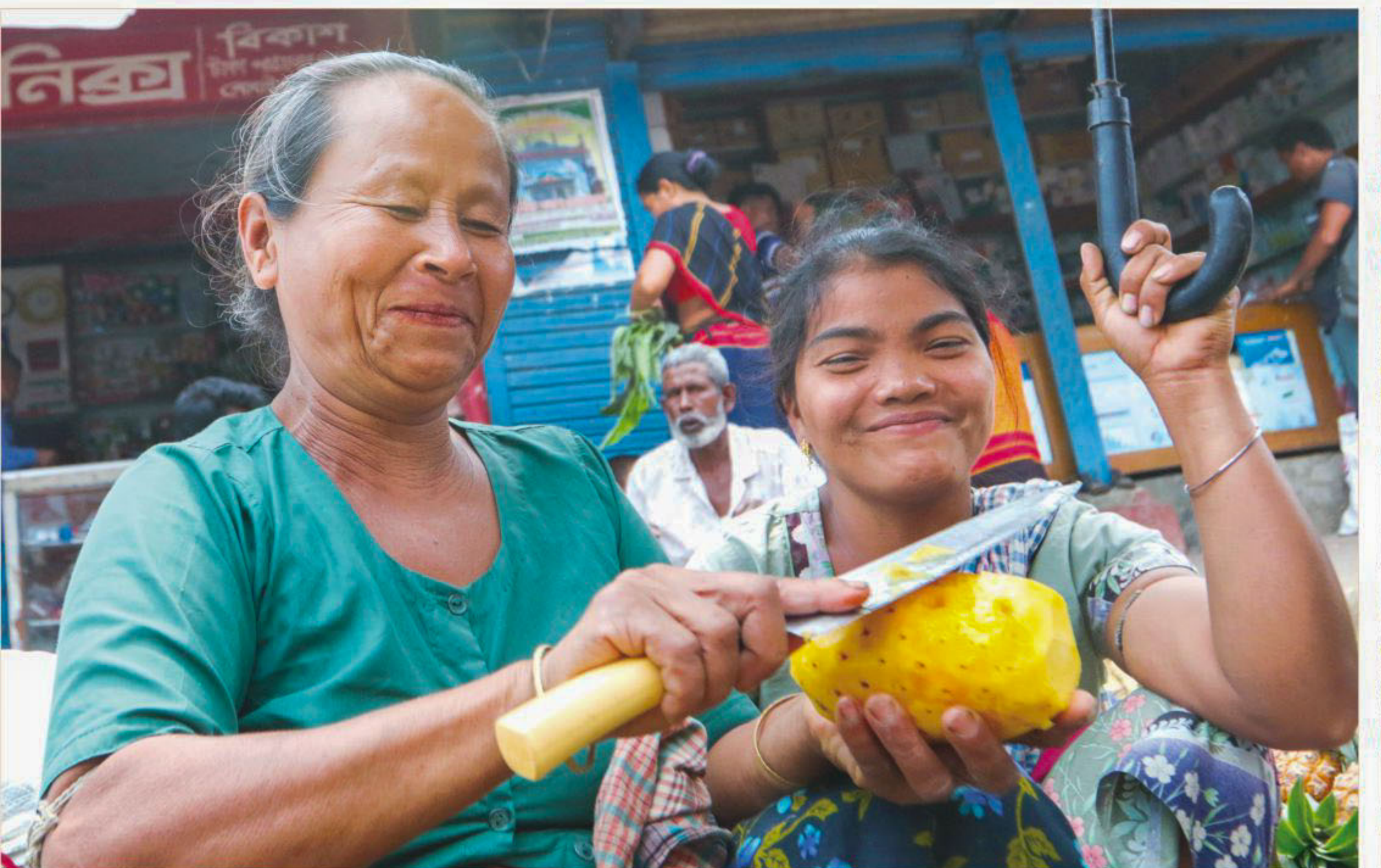
Every Saturday, the Jati Ghat Bazar area in Kaptai upazila livens up. Rows of boats filled with seasonal fruits dock along the bank of Kaptai Lake, while traders unload the delicacies to take them to the nearby market for selling. They come to the bazaar from various parts of Rangamati district. The traders also buy essentials for themselves before returning home. Clockwise from left, An elderly woman peeling off a pineapple before offering the popular fruit to a customer. Fruits being unloaded from the boats. People buying the seasonal delicacies at the bazaar. The photos were taken recently.

Rain/thundershowers with lightning flashes and temporary gusty/squally wind may occur at a few places over Mymensingh and Sylhet divisions and at one or two places over Rangpur, Rajshahi, Dhaka, Khulna and Barisal divisions and the regions of Noakhali & Comilla in next 24 hours till 6:00pm today, UNB said quoting Met office. Mild heat wave is sweeping over Khulna division and the region of Rajshahi. The sunsets in the capital today at 6:21pm and rises tomorrow at 5:35am.