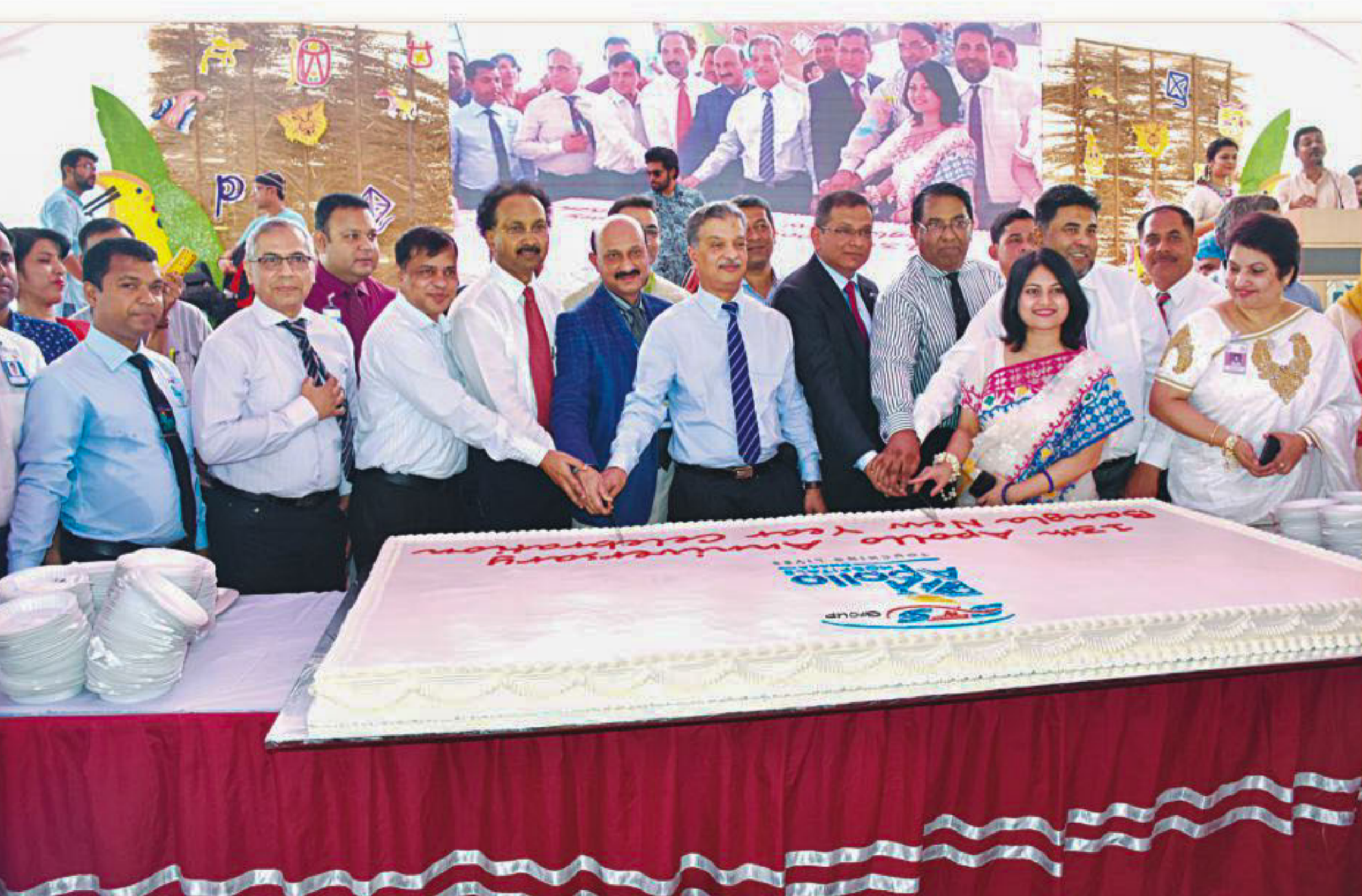
A cake being cut to mark the 13th anniversary of Apollo Hospitals Dhaka yesterday. Consultants, doctors, nurses and staff of different departments of the hospital were present.