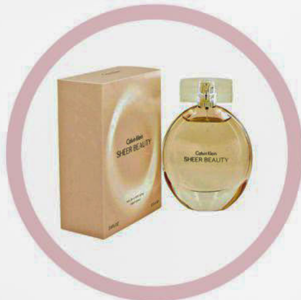
Calvin Klein Sheer Beauty