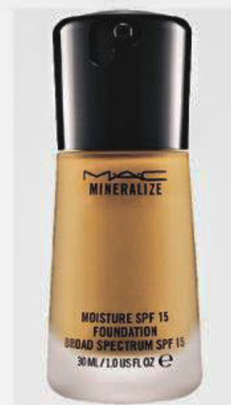
MAC Mineralize Moisture SPF 15 Foundation