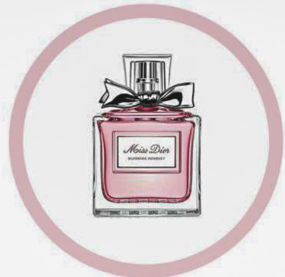
Miss Dior Perfume

Stubborn dark spots reduced For Spot-less Fairness.