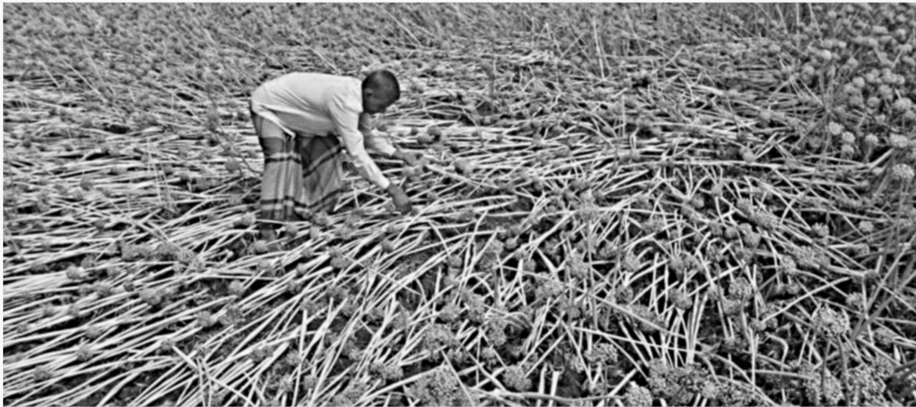
A farmer in his onion seed field looking at the plants that were flattened by heavy rain and hailstorm in Vashanchar village under Sadar upazila of Faridpur.

Repair work of an old bridge on a canal began on April 6 without building any alternative road in Nagarkanda upazila.