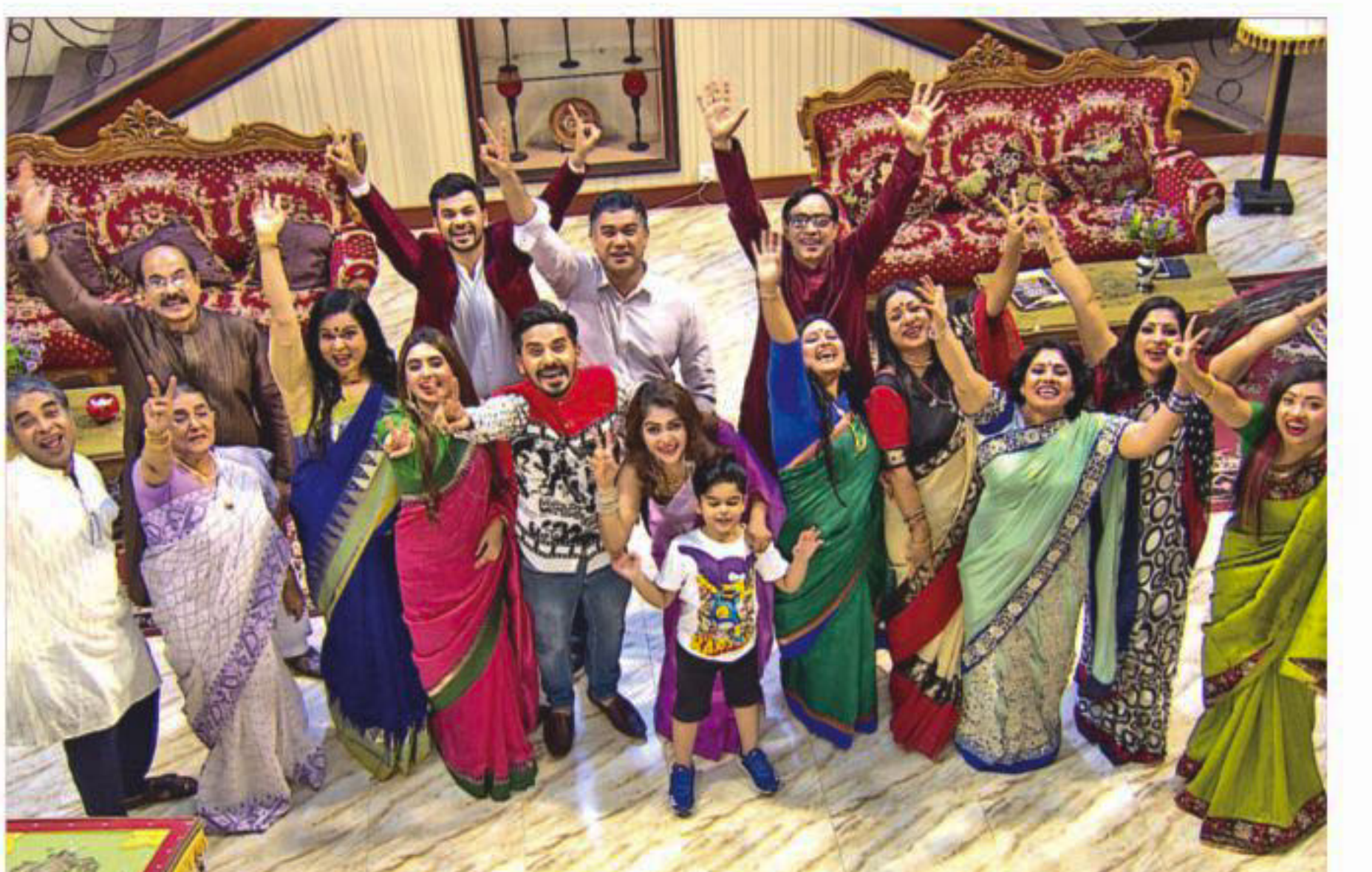
The cast of the play take a group photo on set.