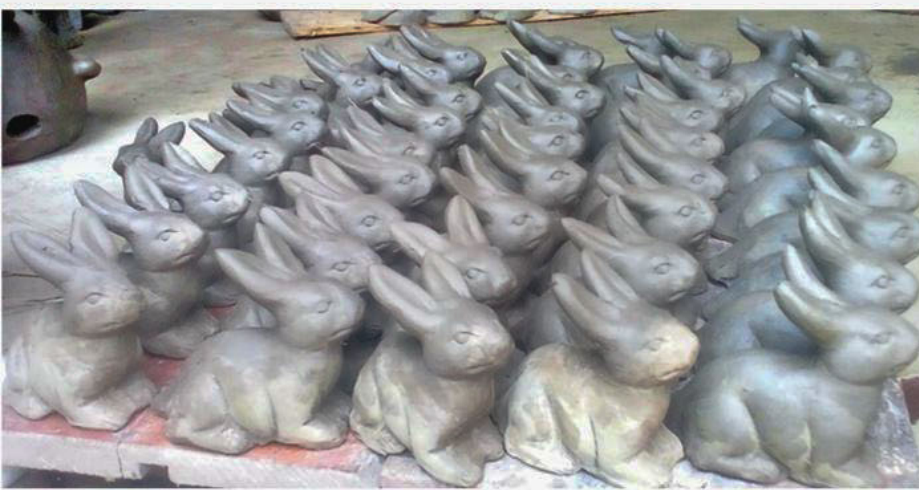
Rabbit clay dolls left to dry, awaiting paint job.

The events of April 14 will include a Baishakhi Mela featuring pitha, artisanal household accessories, and other traditional items. The programme, which will run from dawn till 2pm, will be aired live on Channel i.