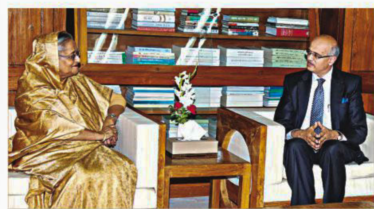
Prime Minister Sheikh Hasina talking with Indian Foreign Secretary Vijay Keshav Gokhale at her office in the parliament building yesterday.