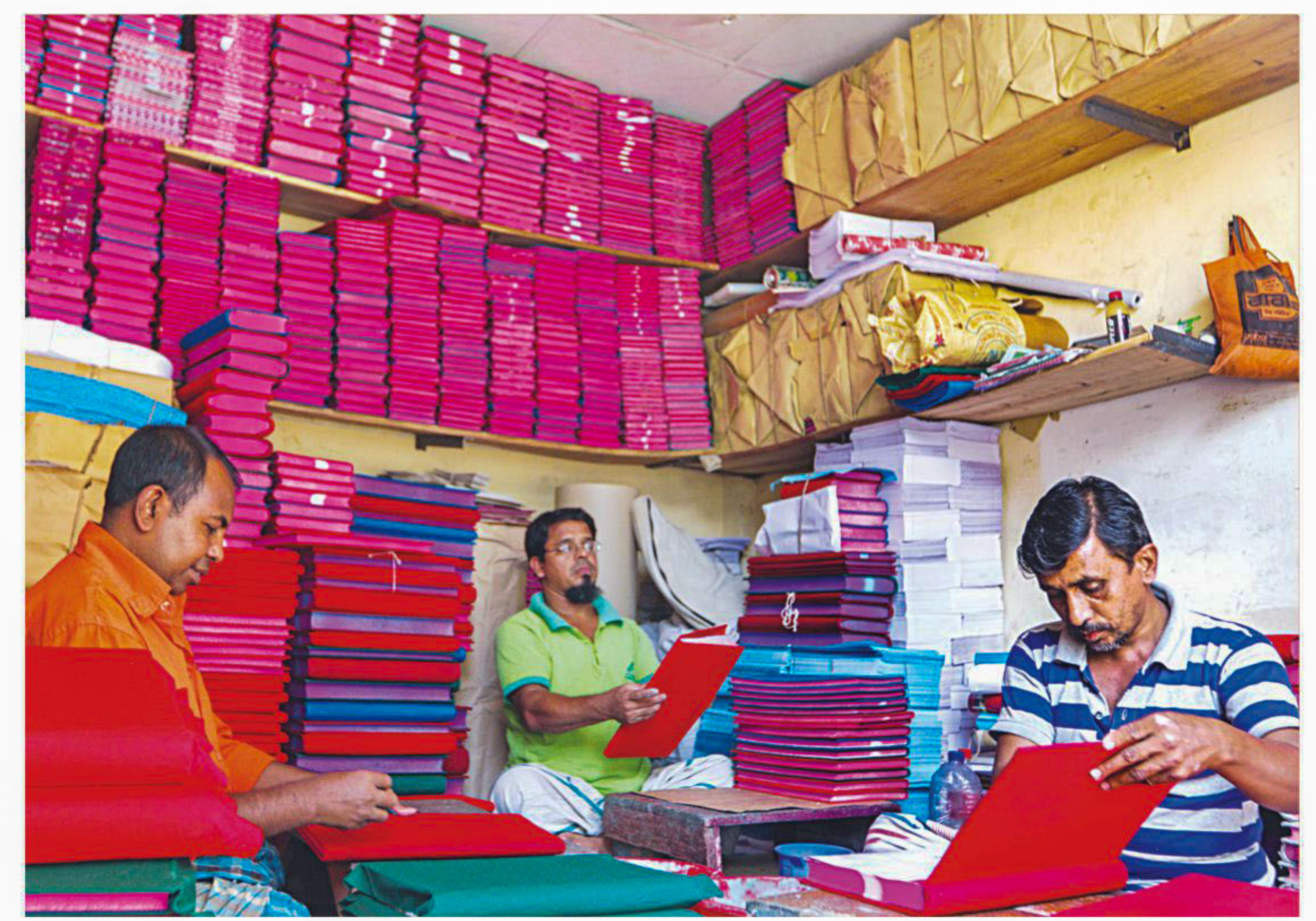
Thousands of new ledgers are being made as traders are set to discard their old ones after all outstanding dues are settled and start afresh on Pabela Baishakh, the first day of the Bangla New Year. The photo was taken from Ghatfarhabeg in Chittagong.