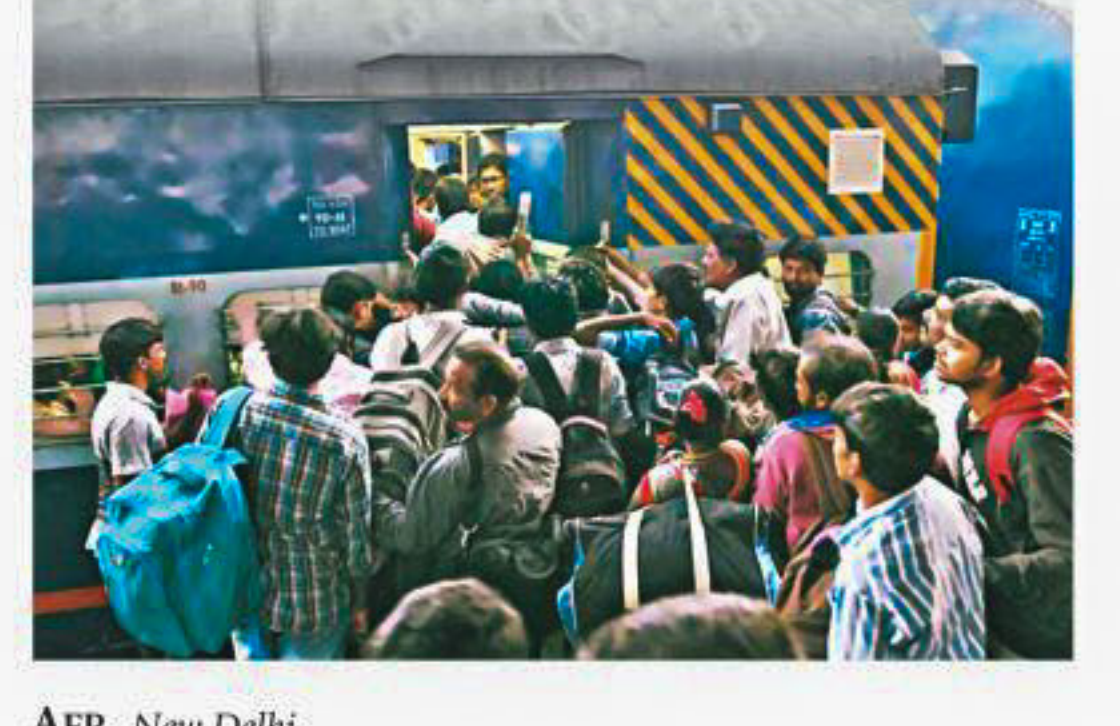
AFP, New Delhi

India's railway ministry said yesterday a "ghastly" accident was narrowly avoided after 22 train coaches carrying some 1,000 passengers became detached from the engine and sped backwards for miles before being stopped.