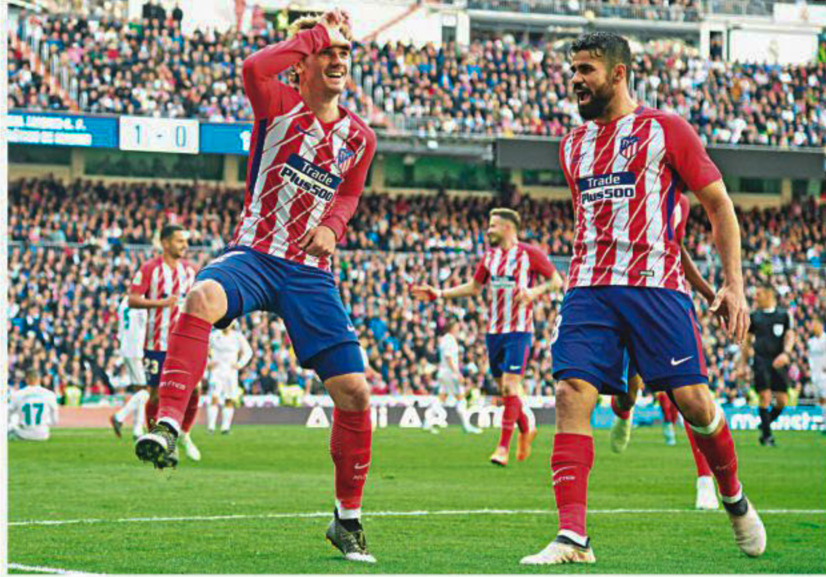
Real Madrid's Cristiano Ronaldo opened the scoring in the Madrid derby, but it took Atletico Madrid's Antoine Griezmann (L) just four minutes to find the equaliser as their La Liga match ended 1-1 draw on Sunday.

Gareth Bale was given 90 minutes, perhaps not the most positive indicator for his chances of a start in midweek. The Welshman supplied the cross for