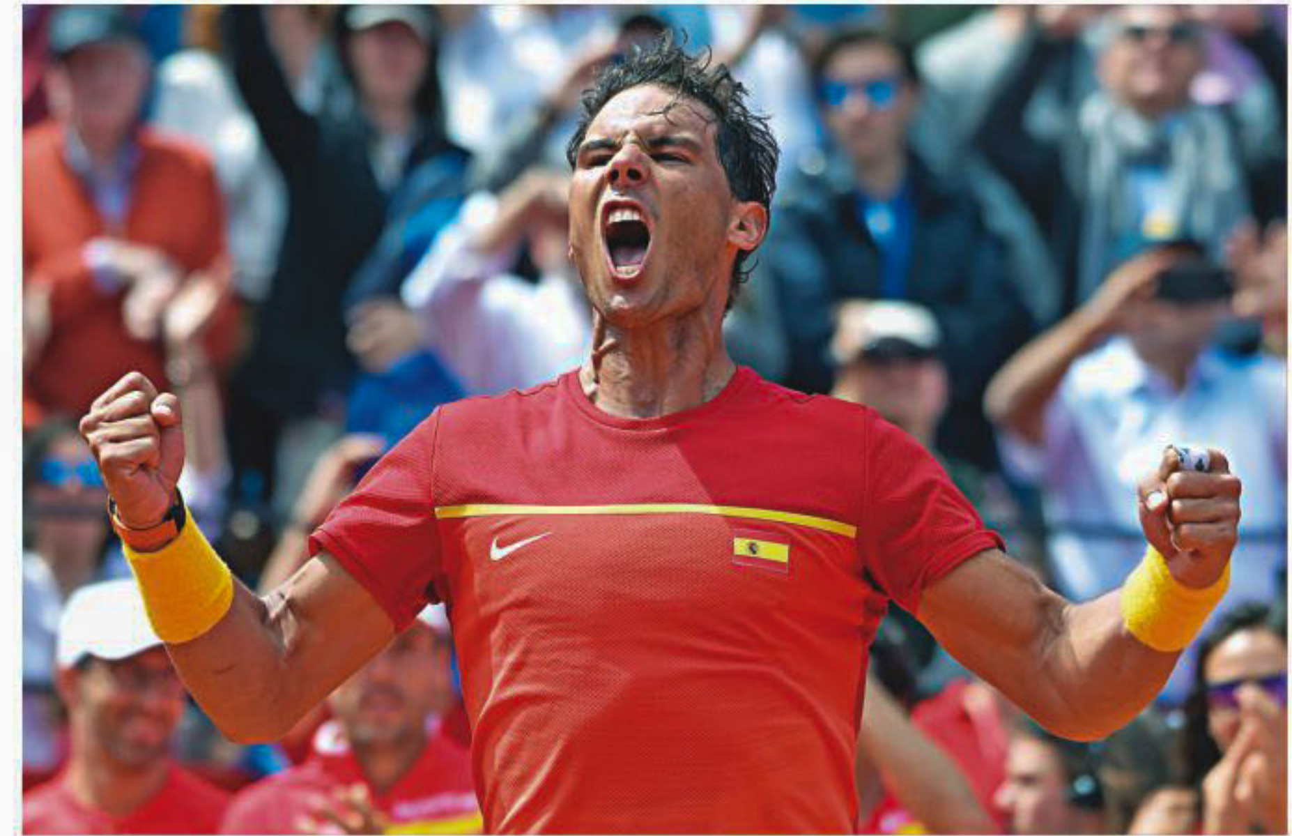
Spain's Rafael Nadal Continued his impressive return from an injury layoff with a straight-sets quarterfinal victory over Germany's high-flying Alexander Zverev that levelled their Davis Cup tie at 2-2 in Valencia yesterday.

He beat Kohlschreiber in straight sets on Friday after Zverev had overcome Ferrer. Germany then took a 2-1 lead when Tim Puetz and Jan-Lennard Struff won the doubles rubber against Spain's Feliciano and Marc Lopez.