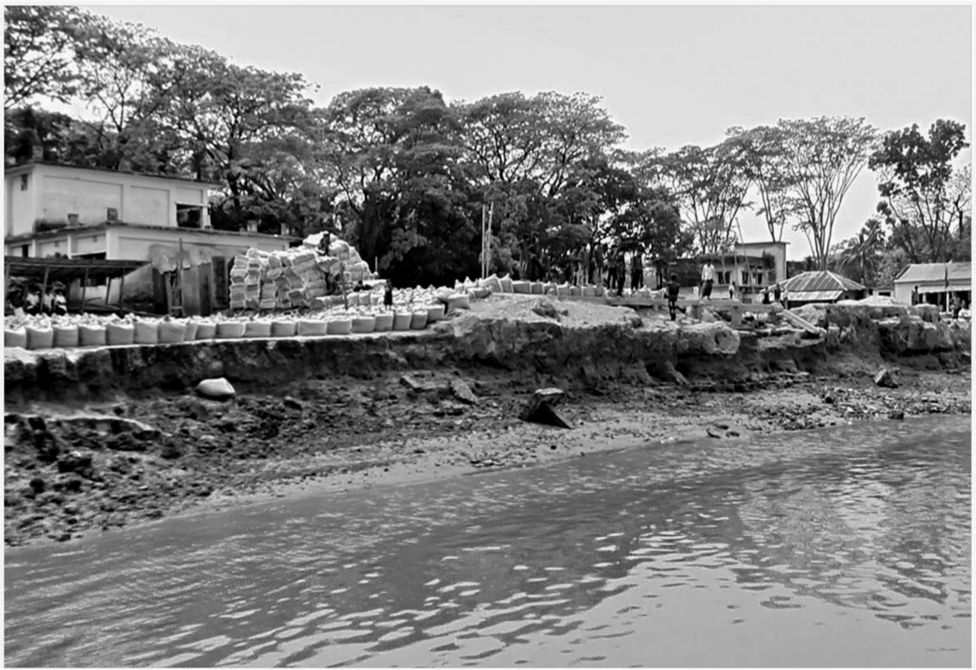
The people of Paul Para village in Hijla upazila of Barisal pile up sand-filled geo bags on the bank of the Meghna river to protect their village from erosion. The photo was taken a few days ago.

"I am trying to include Paul Para in the next project," said local lawmaker Pankaj Devnath, adding that he had donated Tk 5 lakh to the committee.