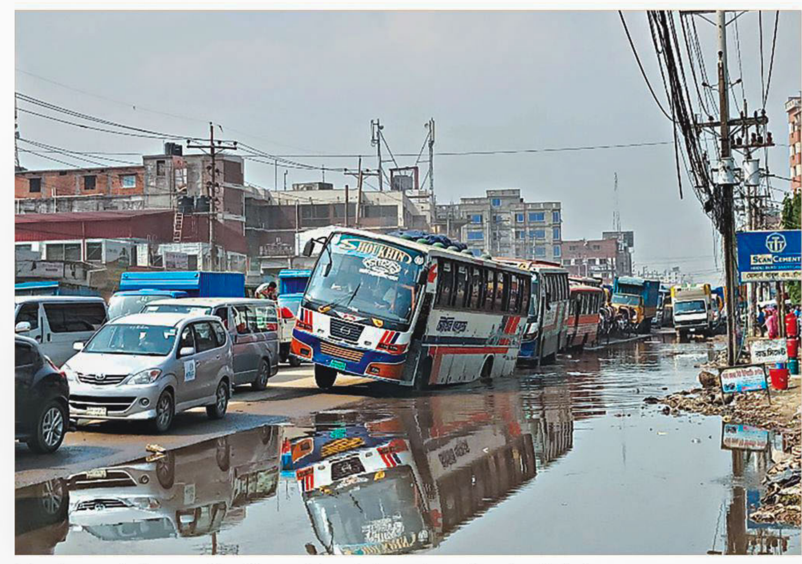
A bus dangerously tilts to one side while negotiating a broken and water-logged road in Gazipur. Numerous roads around the country fall into disrepair sometimes less than a year into their construction. Lawmakers at a meeting yesterday demanded roads be repaired before the election in a way that their lifespan is extended.