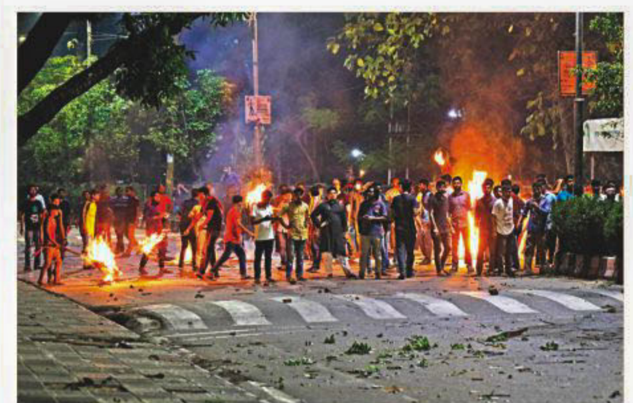
Police fire teargas shells on demonstrators at a rally for quota reforms at Shahbagh intersection in the capital yesterday. Clockwise from top, a section of demonstrators march down a road in front of Aziz Supermarket. Bottom, students gather near Shahbagh, with some carrying makeshift torches.