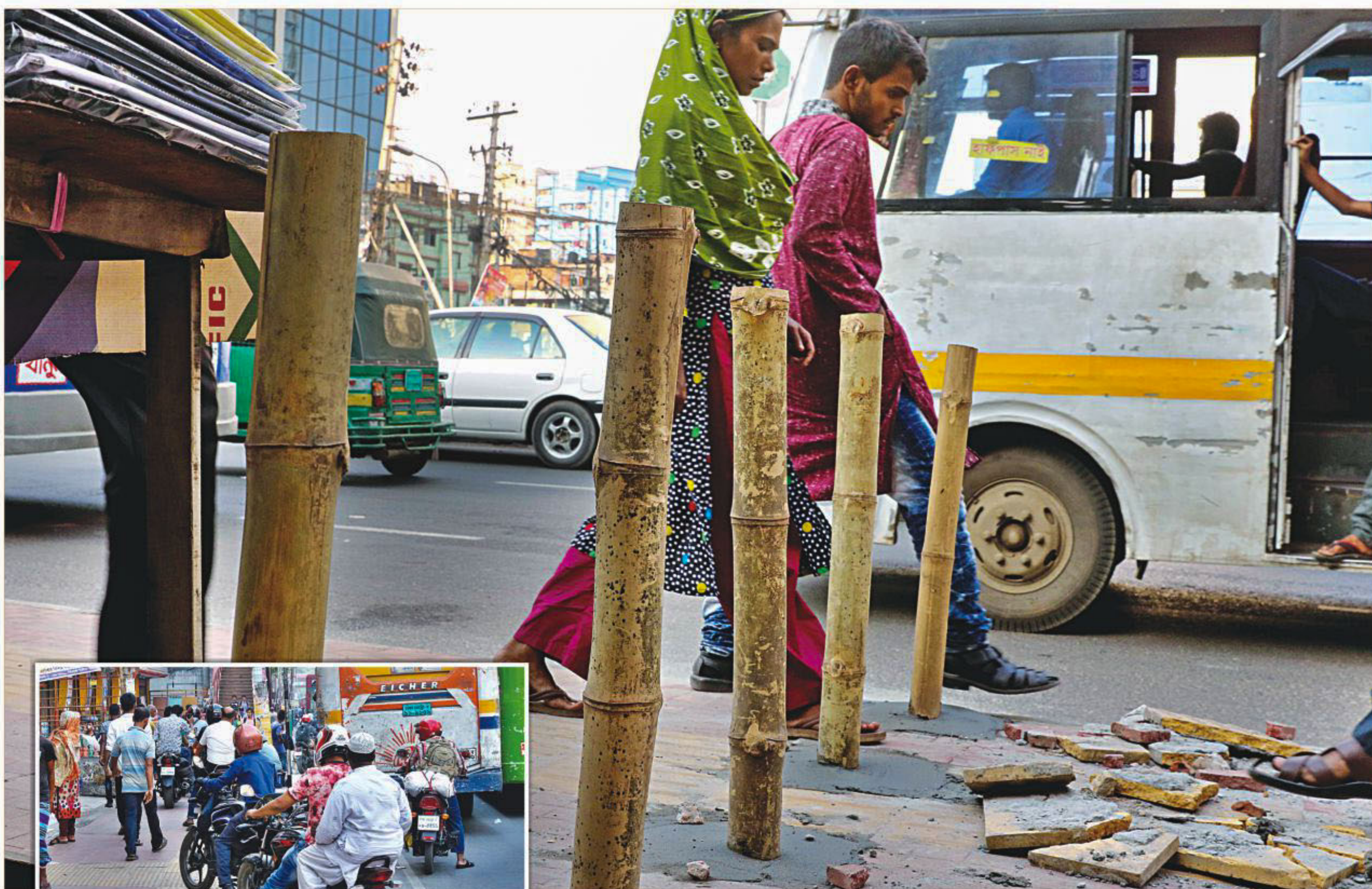
As bikers won't stop using footpaths as seen on the inset photo, the authorities have to do something about it. To block them, bamboo poles have been set up on a footpath on Kazi Nazrul Islam Avenue in the capital. The photos were taken on Thursday.