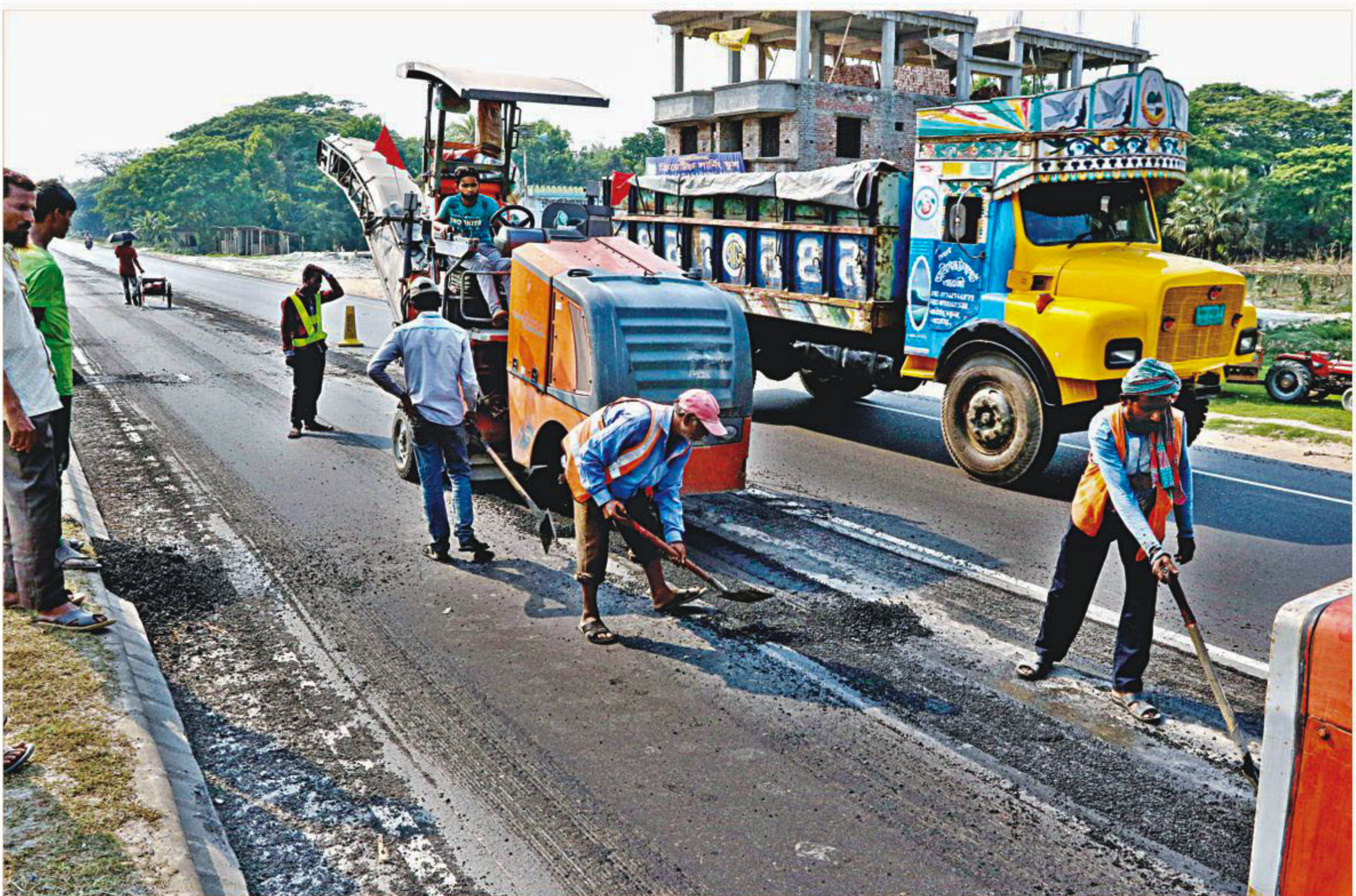
Workers and a road milling machine have been deployed to smooth down the Dhaka-Chittagong highway after the surface became uneven because of "overloading". The photo was taken at Dhamoti in Cumilla on Wednesday.