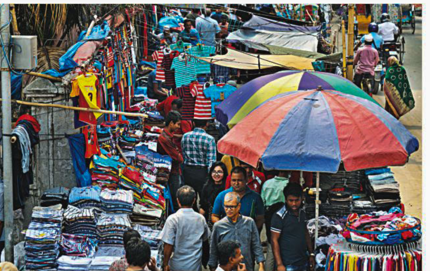
Dhaka's footpaths are being used for everything except for the reason it was made -- ensuring smooth movement of the pedestrians. Clockwise from top, Occupying the entire breadth of the footpath on Bir Uttam Rafiqul Islam Avenue, a worker works on a billboard structure yesterday. People squeeze through a narrow stretch in the front of a footpath in GPO area of Gulistan on Tuesday, as most of it remains under the hawkers' clutch. Almost an identical situation prevails in front of the Baitul Mukarram National Mosque.