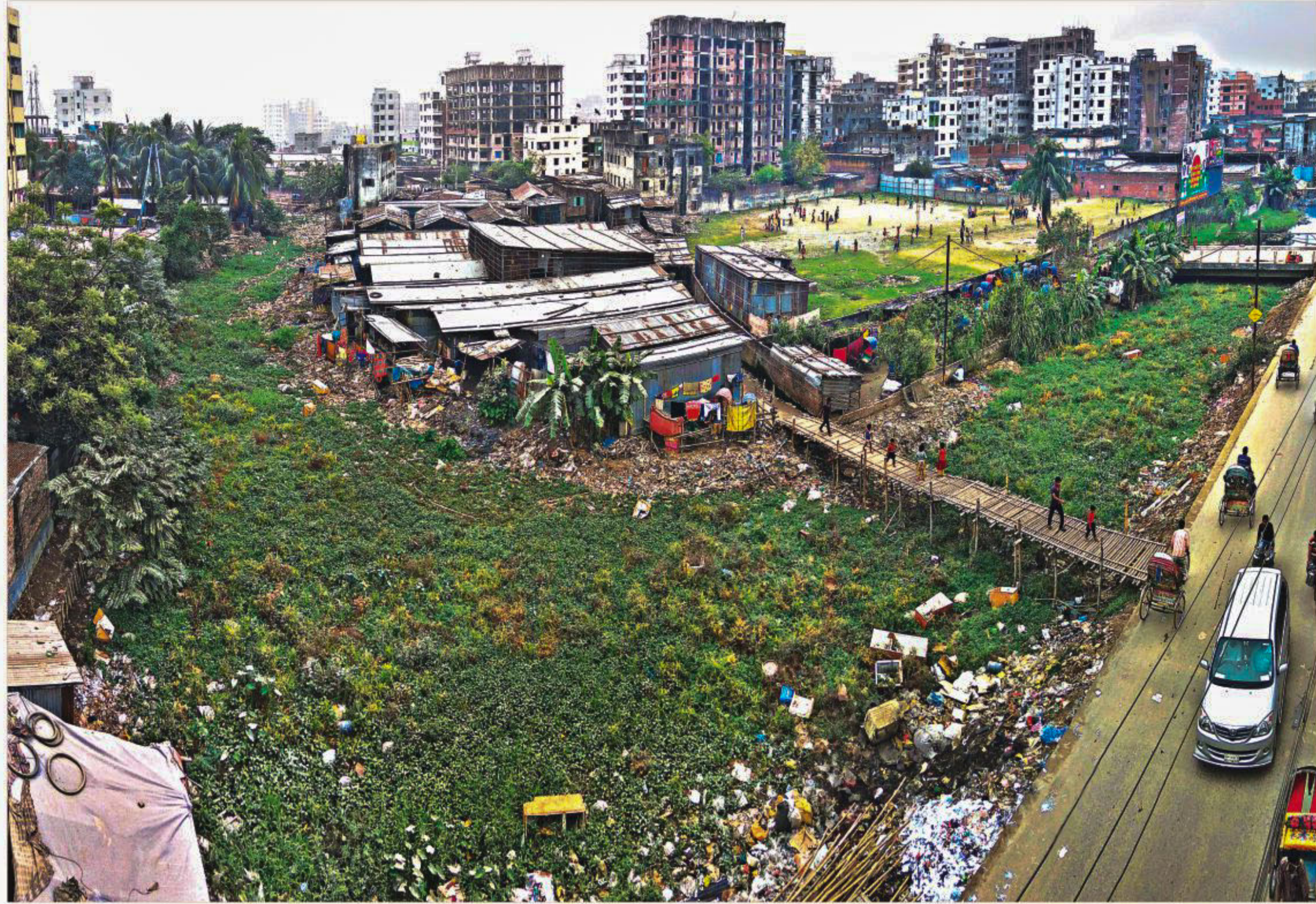
Dumping of waste and encroachment by unscrupulous people into the Ramchandrapur canal have left the waterway in a sorry state. There is hardly any flow of water in the canal now. The photo was taken in the city's Mohammadpur area yesterday.