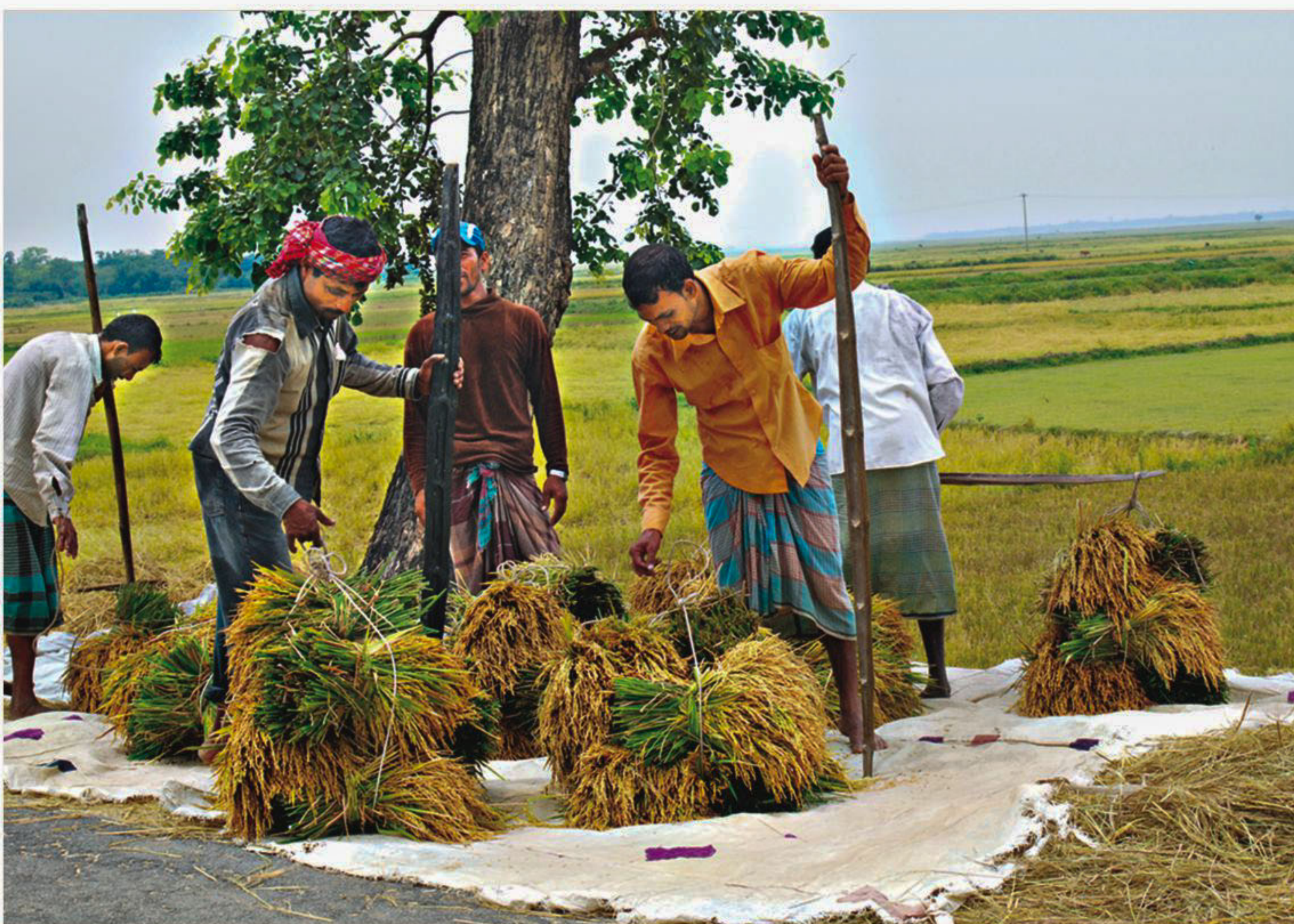
Farmers harvesting paddy in Sunamganj's Dakshin Sunamganj upazila yesterday. Growers in Sylhet's haor region are eyeing a bumper yield of paddy this season after losing crops to flashfloods in the last two years.