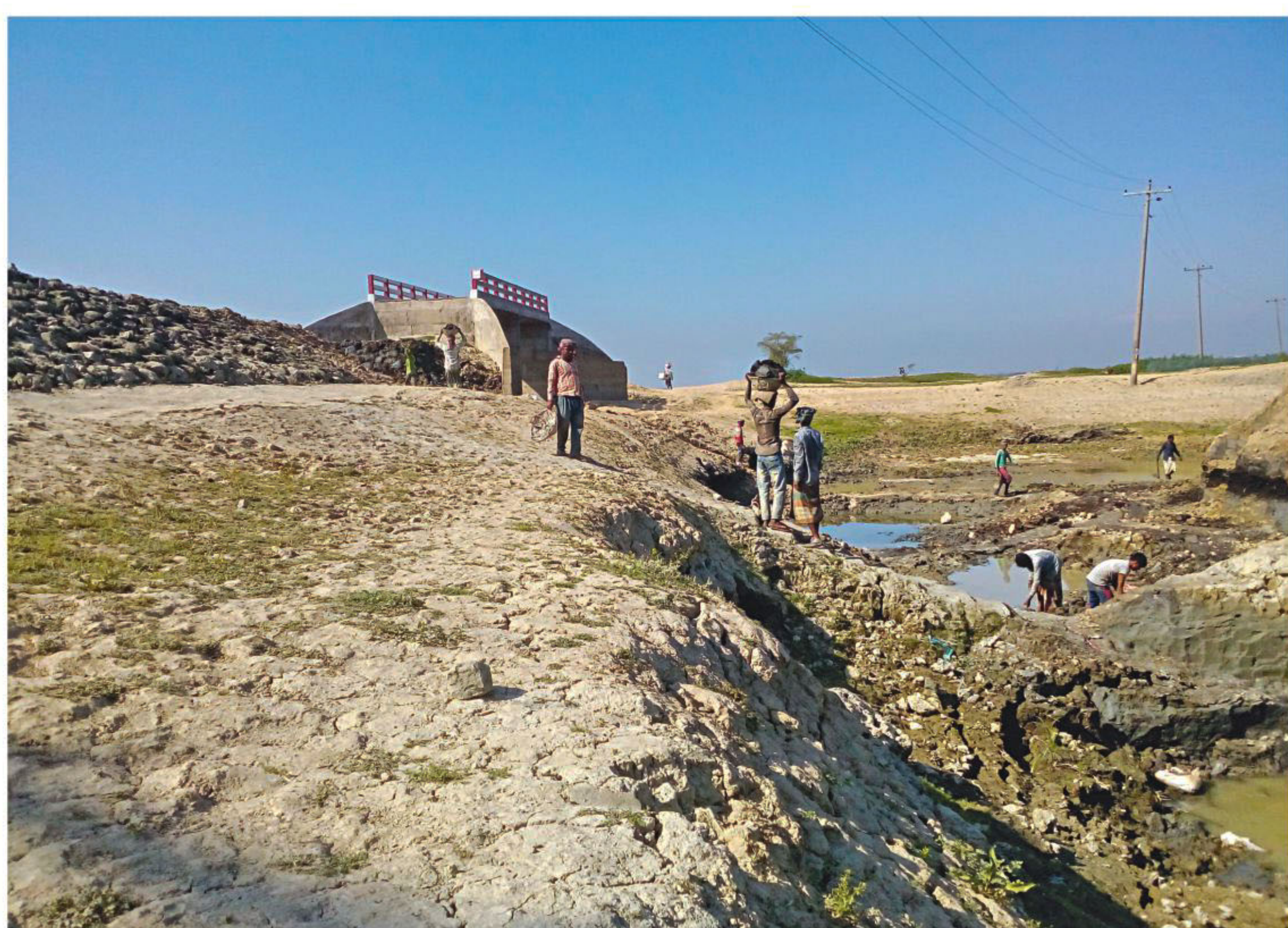
Workers collecting soil from as close as 10 metres of an embankment being repaired near Cheftir Haor in Sunamganj recently. According to government rules, no earth should be removed from within 50 metres of an embankment under construction.