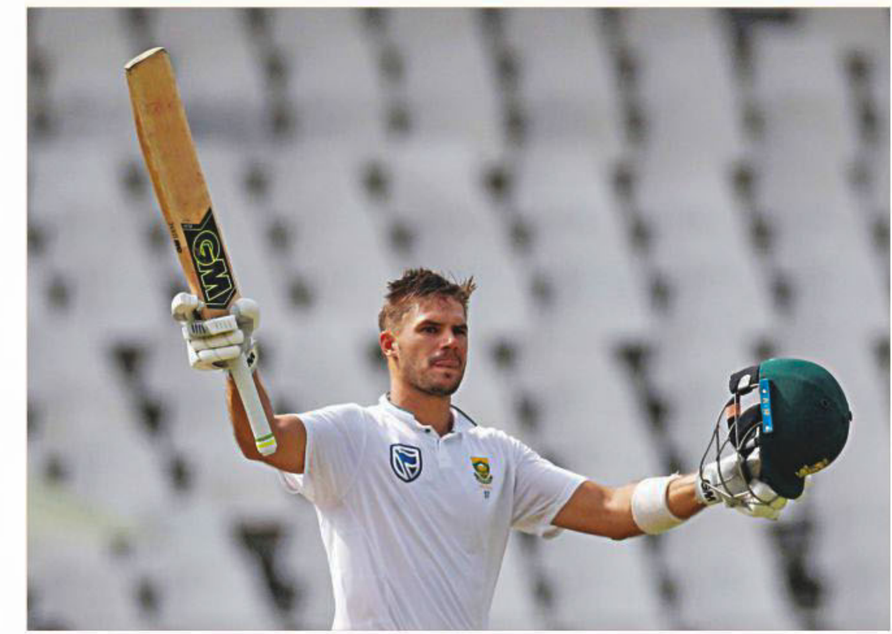
South Africa opener Aiden Markram scored his second century of the series on the first day of the fourth Test against Australia in Johannesburg yesterday.

SCORES IN BRIEF SOUTH AFRICA: First innings 313 for 6 (Markram 152, Amla 27, De Villiers 69, Bavuma 25 not out; Sayers 2-64, Cummins 3-53)