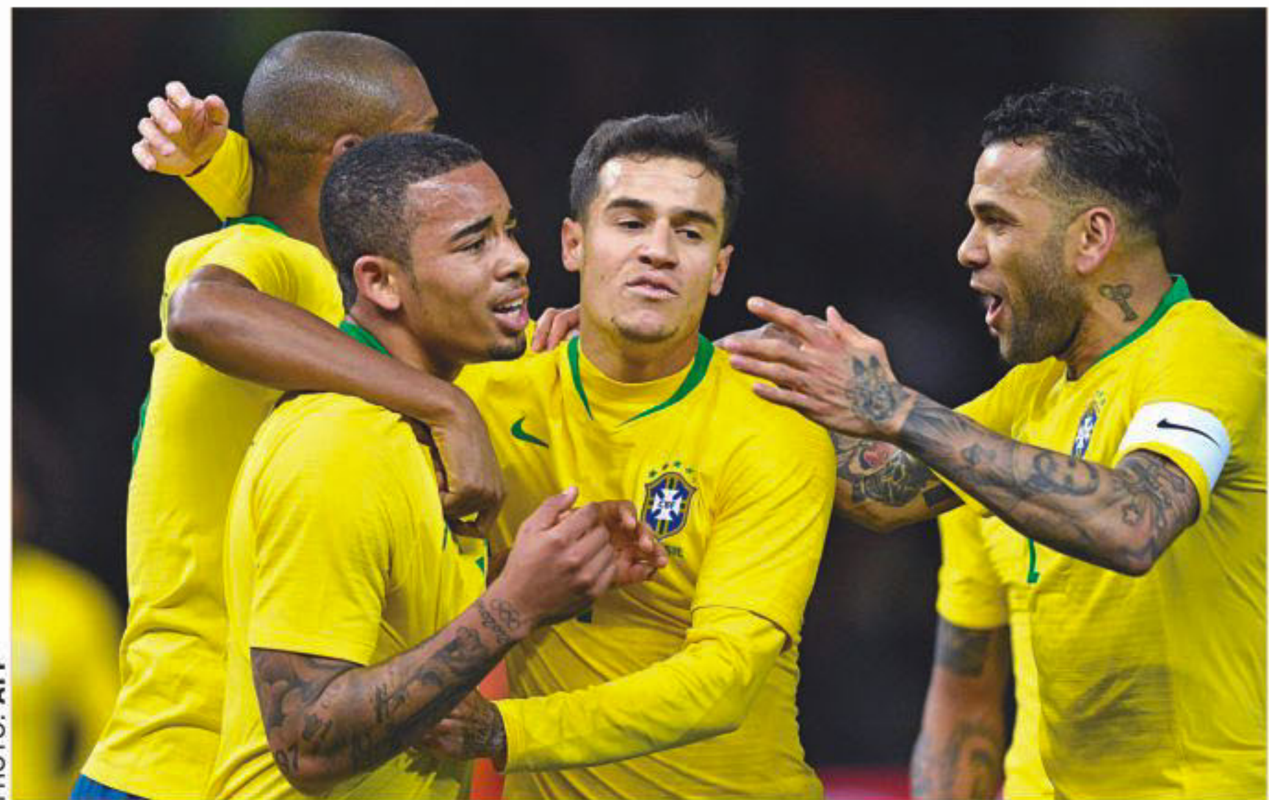
Brazil striker Gabriel Jesus (2nd from L) celebrates his all-important goal with teammates during their international friendly against Germany in Berlin on Tuesday.

Romelu Lukaku grabbed two goals as a strong Belgium side romped to a comfortable 4-0 victory over Saudi Arabia in Brussels, with Michy Batshuayi and Kevin De Bruyne also on target.