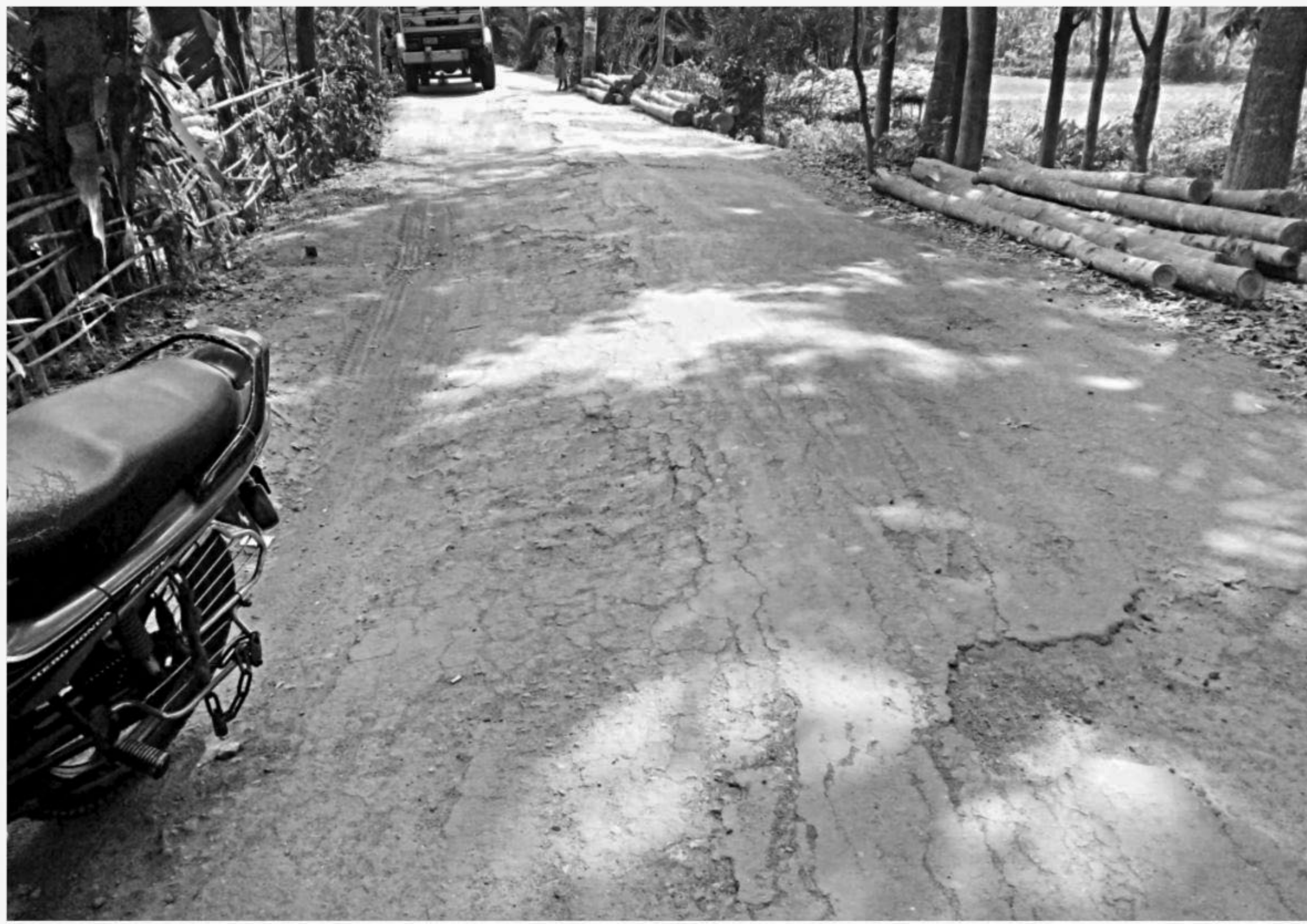
A portion of the damaged Amua-Kathalia-Rajapur-Jhalakathi road. The photo was taken at Angaria village in Rajapur upazila of Jhalakathi recently.