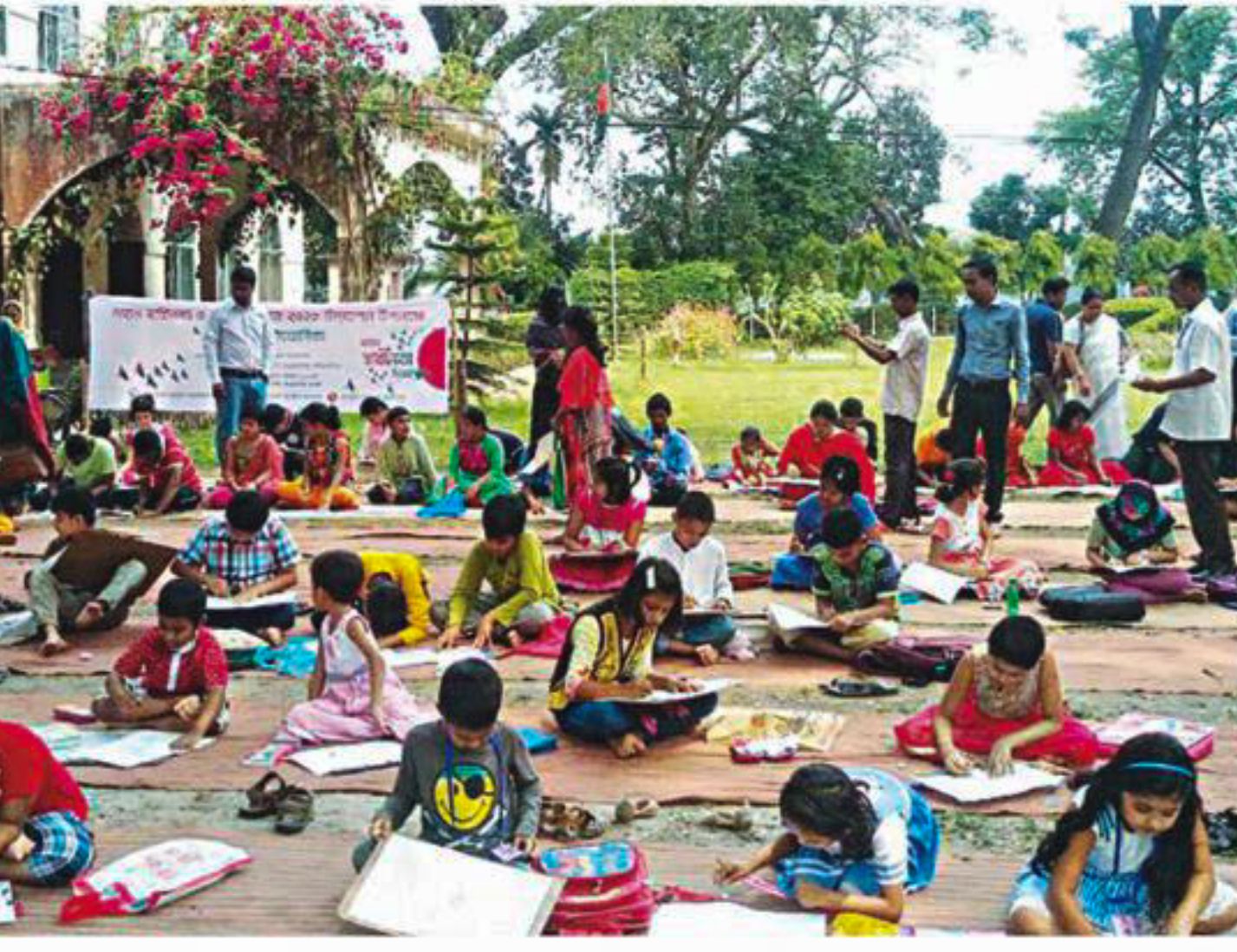
Children have a field day.