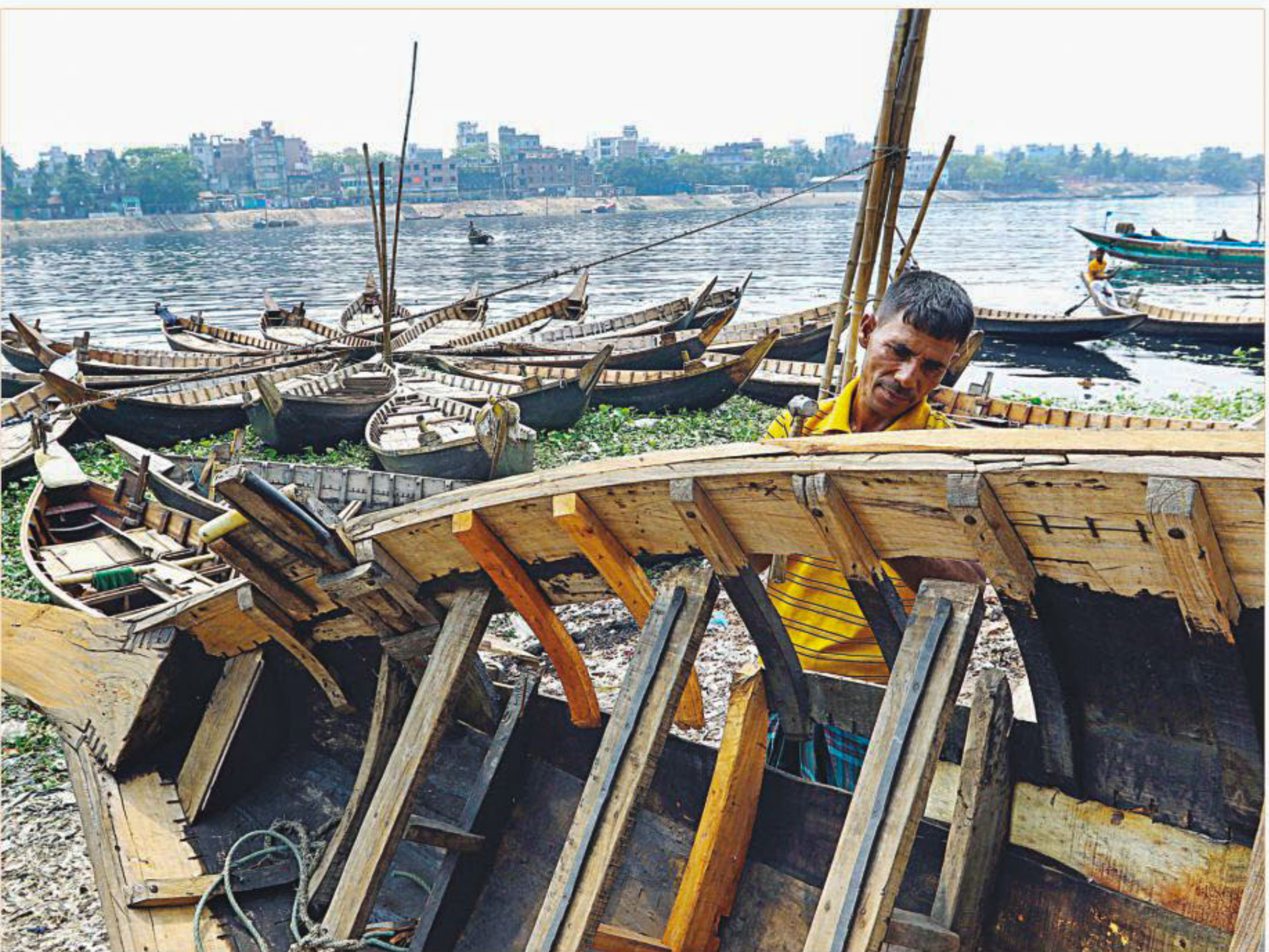
Boats being fixed on the bank of the river Buriganga ahead of monsoon. The photo was taken from Kamrangirchar area in Dhaka on Friday.