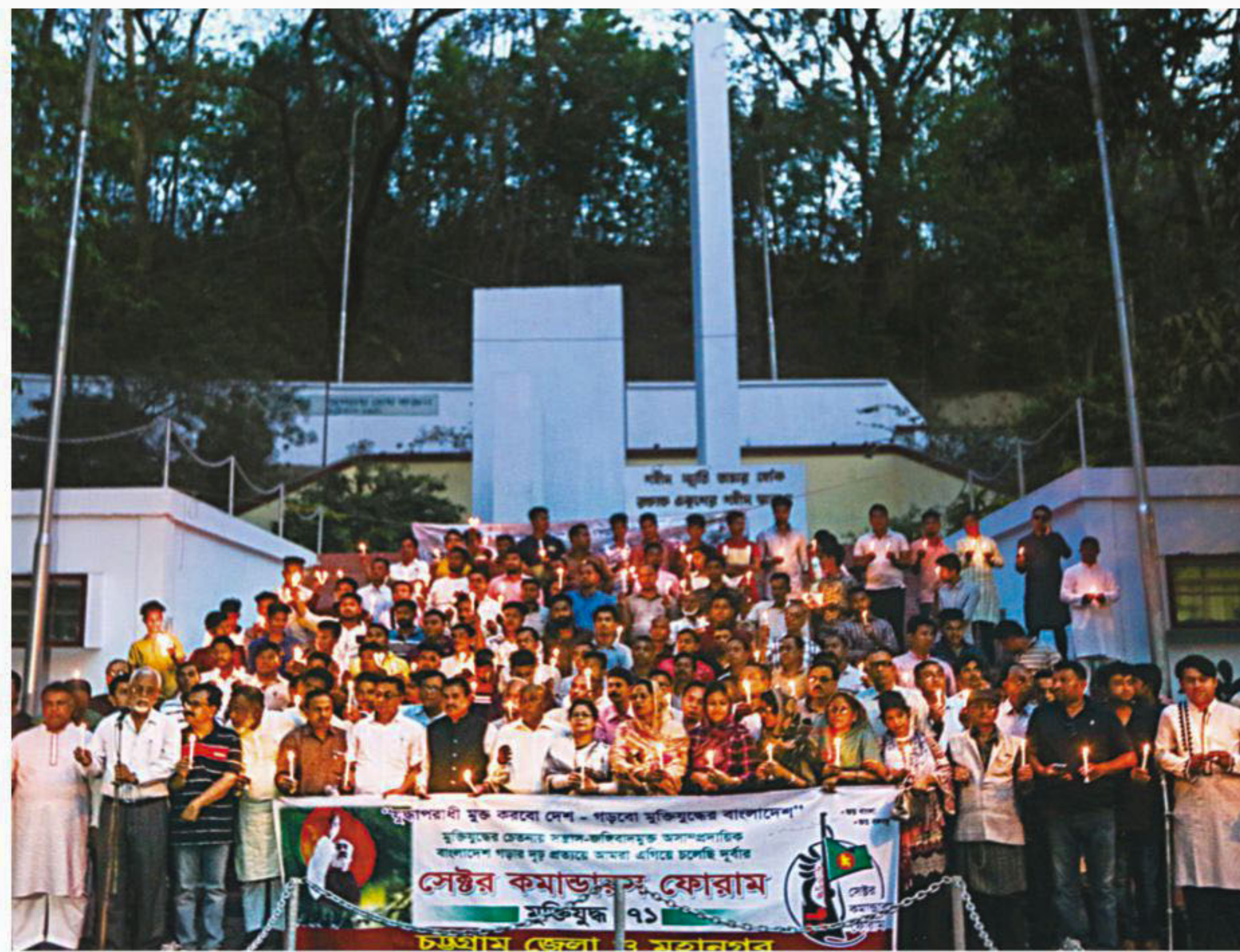
Recalling the memories of the fateful March 25 night, Sector Commanders' Forum holds a candle light vigil at the Central Shaheed Minar in Chittagong city yesterday. On that night in 1971, Pakistani occupation army cracked down on the Bangalees and killed them indiscriminately.