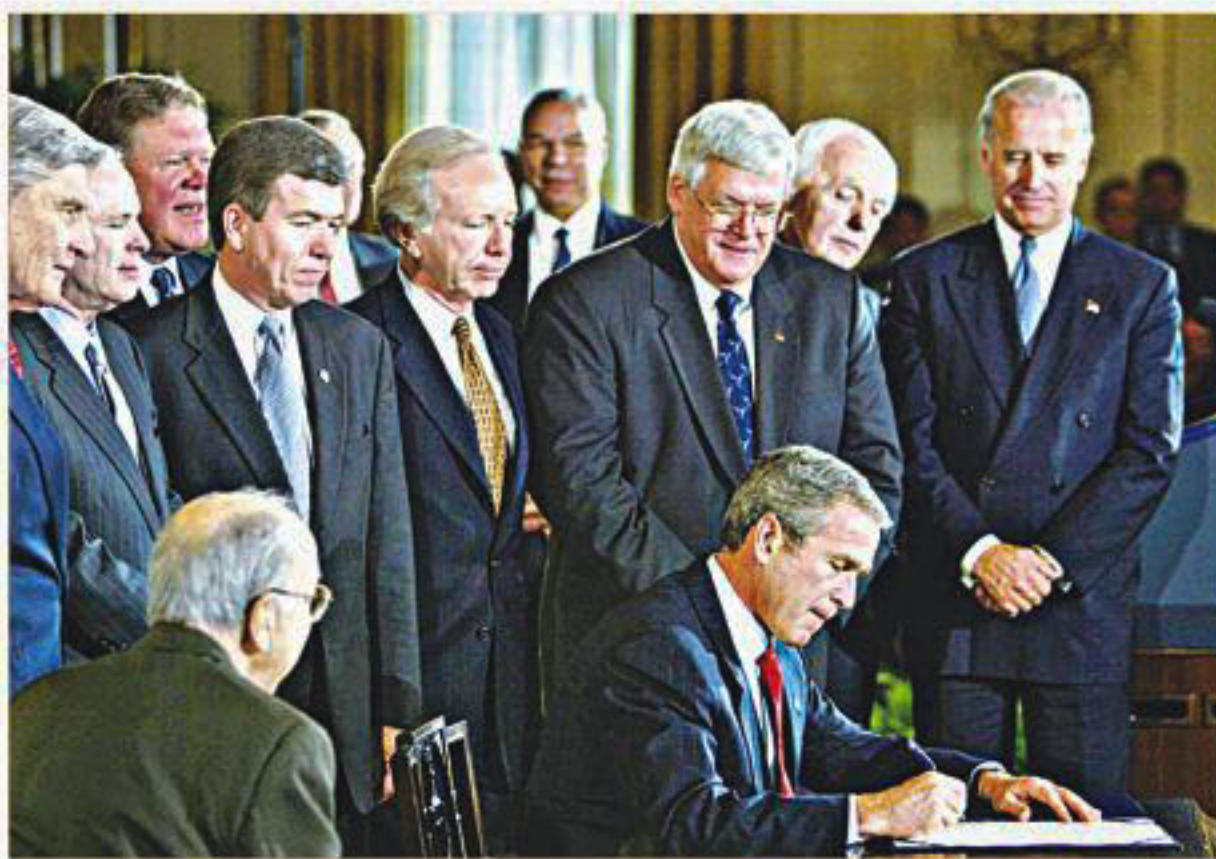
President Bush in October 2002, signing the authorisation for use of force in Iraq, which the congressional leaders around him approved.