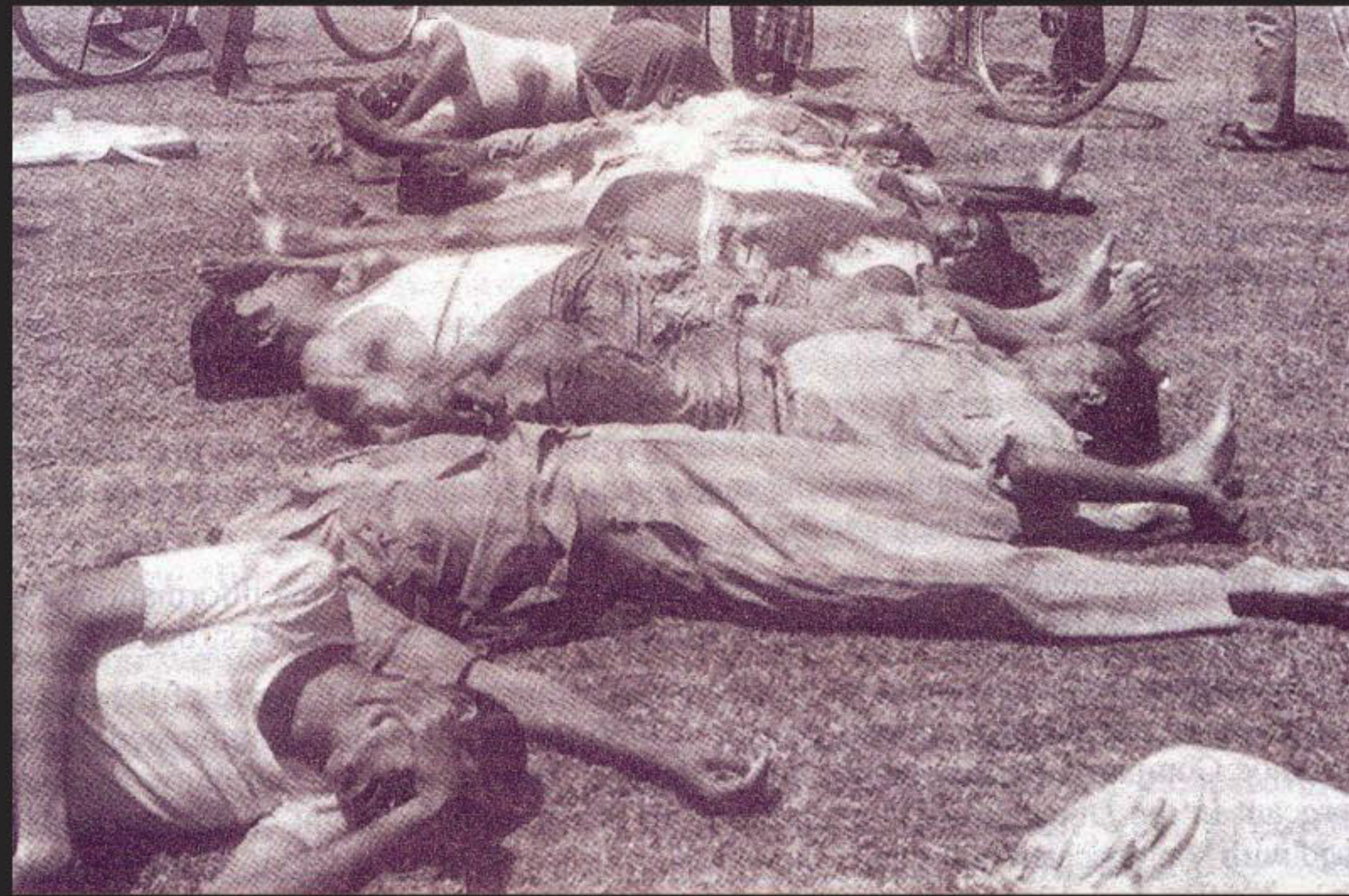
Bodies of Dhaka University students lie on Iqbal Hall ground on March 26, 1971.