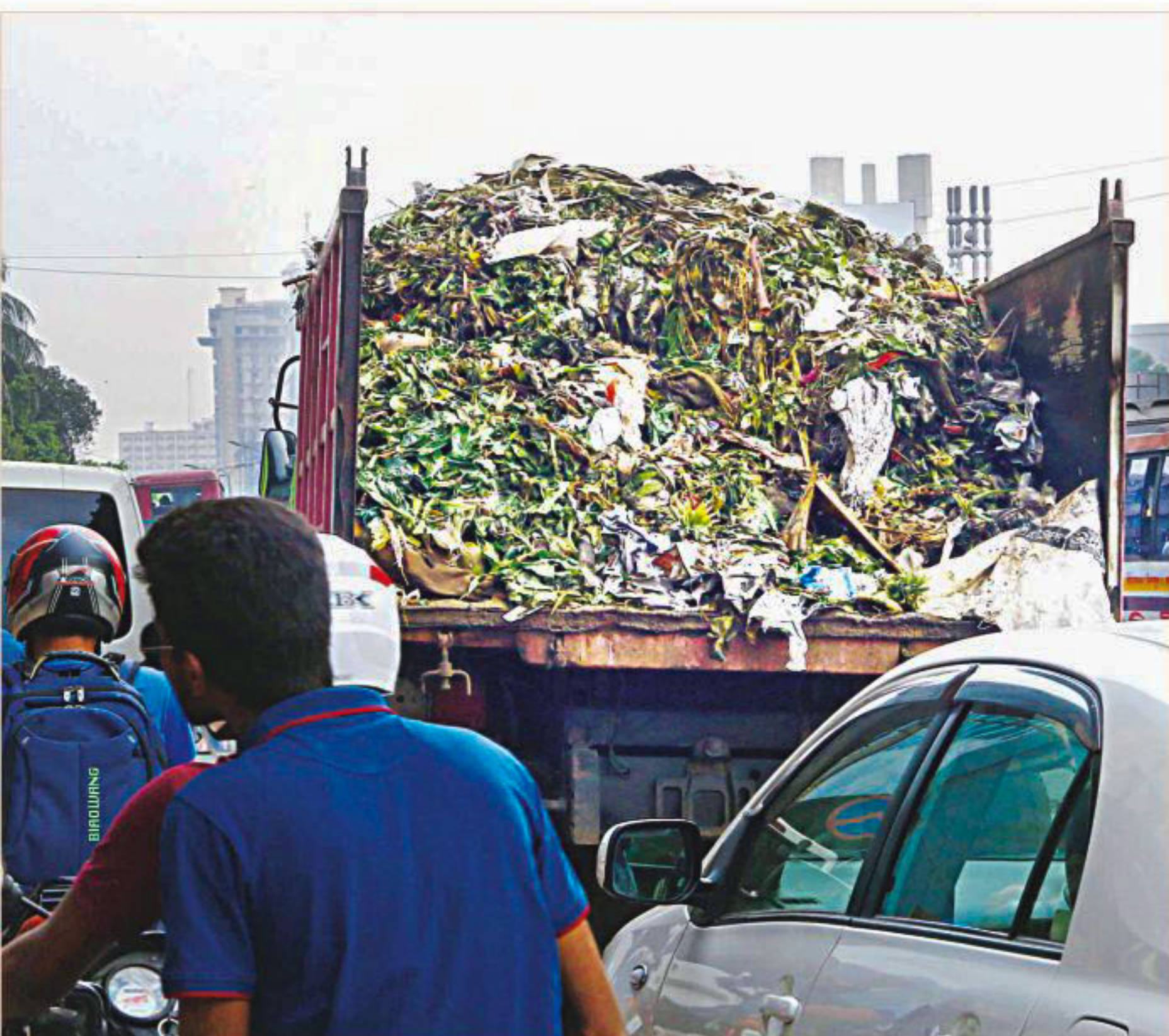
A truck loaded with garbage moves slowly through traffic near Karwan Bazar while people bear the repugnant stench yesterday afternoon. The High Court on October 16 last year directed both the city corporations of Dhaka to have garbage transported by covered trucks between 10:00pm and 6:00am.