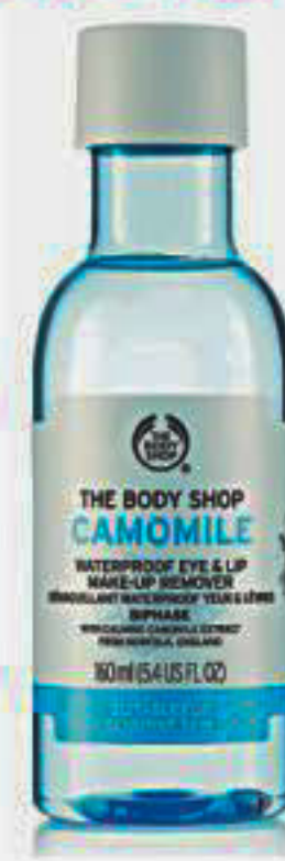
Waterproof Eye And Lip Makeup Remover