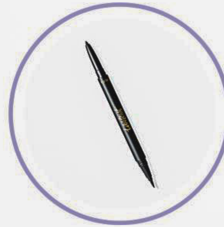
Tarte Tartiest Double Take Eyeliner