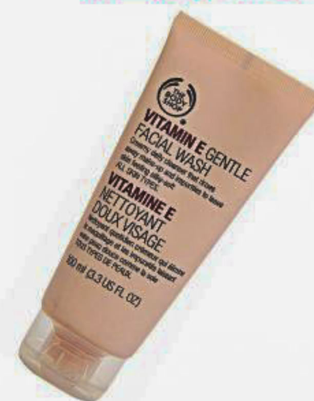
The Body Shop Vitamin E Gentle Facewash