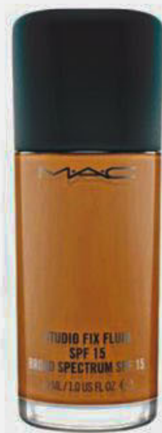
Mac Studio Fix Fluid Foundation