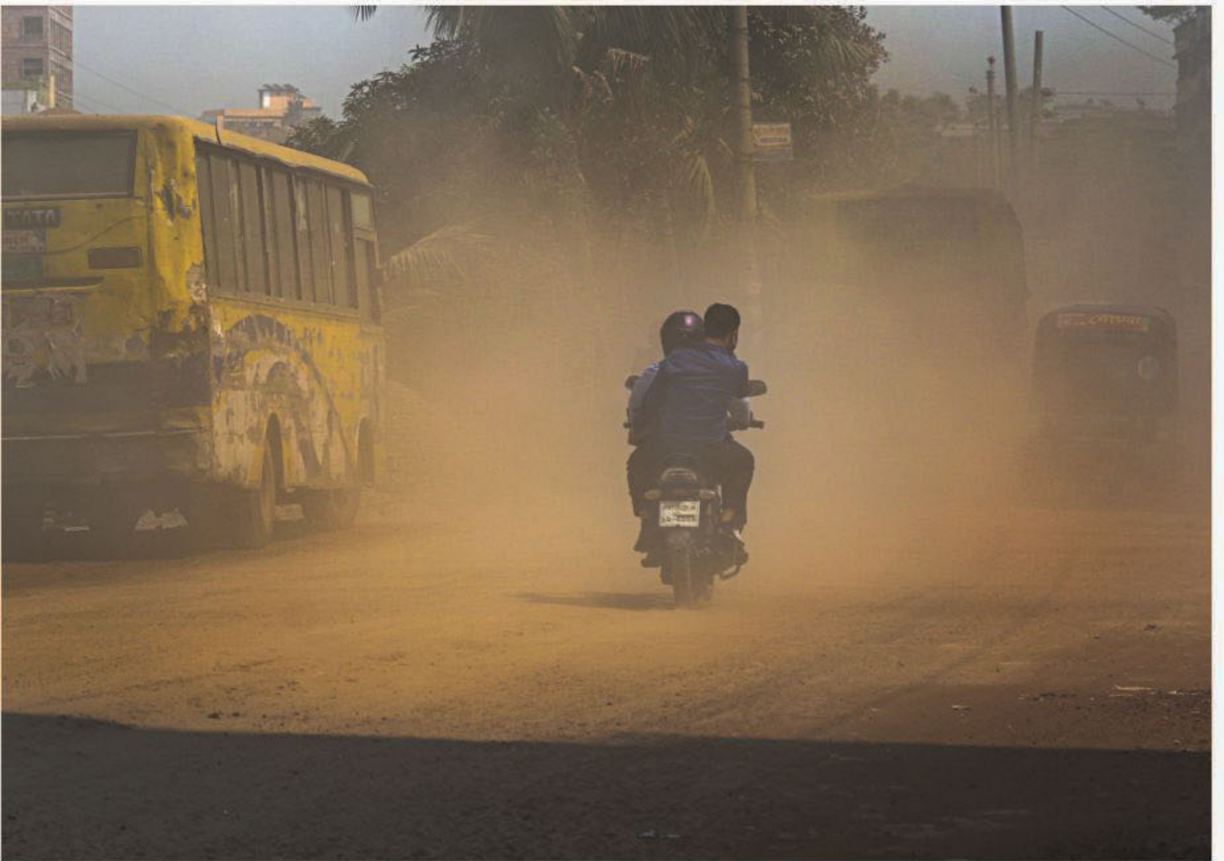
Vehicles kick up dust as they drive through the run-down Rampura-Demra road in the capital's Banasree area yesterday. The road has been in a poor state for months, but the authorities seem to be turning a blind eye to the suffering of commuters.

HELEMUL ALAM and MAHBUBUR RAHMAN KHAN Mosquitoes have developed no new "hyper-reproductive capacity" but they are being farmed in Dhaka. When Dhaka-dwellers are finding it hard to cope with the growing mosquito menace, eleven organisations have been found helping the insect population to rise by the millions every day. The organisations, including north and south city corporations, have around 50 canals, 12 lakes, 23 ponds, and other water-bodies spanning over no less than 4,000 bighas. During an investigation, The Daily Star found nine organisations, which do not spend a single taka and two others which spend only a meagre amount, to clean the vast swatch of stagnant water-bodies in and around the capital, considered ideal conditions for mosquitoes to breed. The primary responsibility of controlling the mosquito population lies with both the city corporations. However, the only step they are seen taking is occasional spraying of insecticide around city households and into a few drains and water bodies. Despite the Chikungunya outbreak last year, none of the organisations, city corporations apart, cared to clean the stagnant water bodies. When queried on their failure to maintain the water bodies, the identical answer is: It's the job of the city corporations. In the last five years, both the corporations have spent around Tk 150 crore on mosquito control but those could not give any relief to Dhaka dwellers. SEE PAGE 10 COL 1